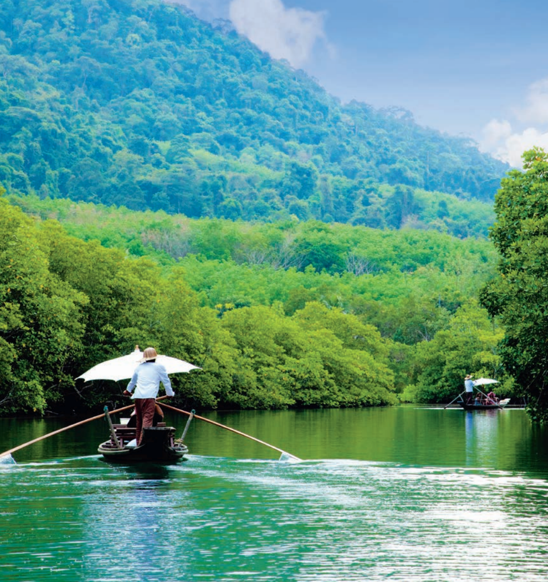
Ao Salak Khok