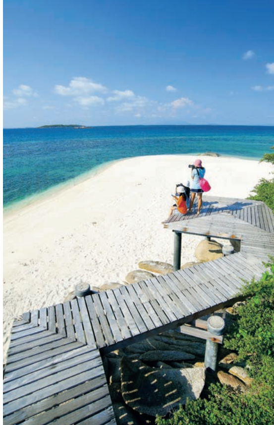
Ko Man Nok

There are plenty of seafood restaurants dotted around the island and with the recent addition of a number of resorts; visitors can now enjoy a wide range of local and international cuisines. Ao Bang Bao is famous for having countless restaurants offering delicious fresh seafood with reasonable price. As the island only has a single road and most restaurants are located