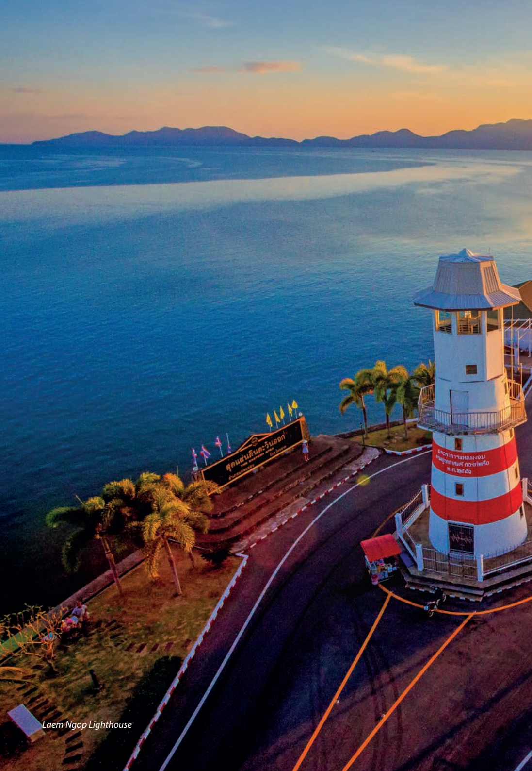
Laem Ngop Lighthouse