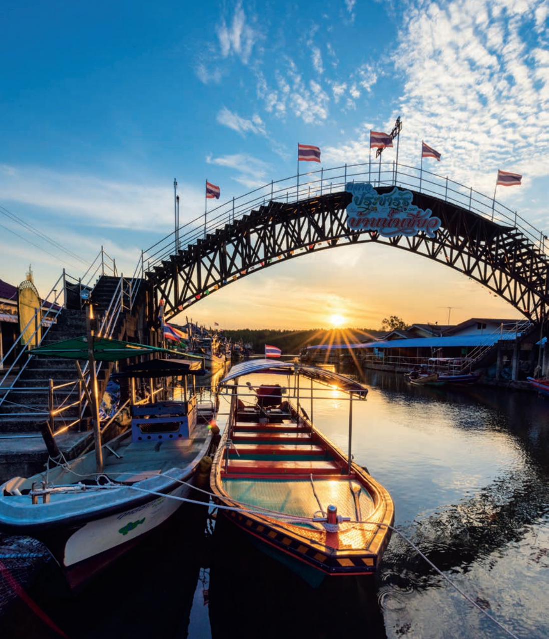
Ban Nam Chiao