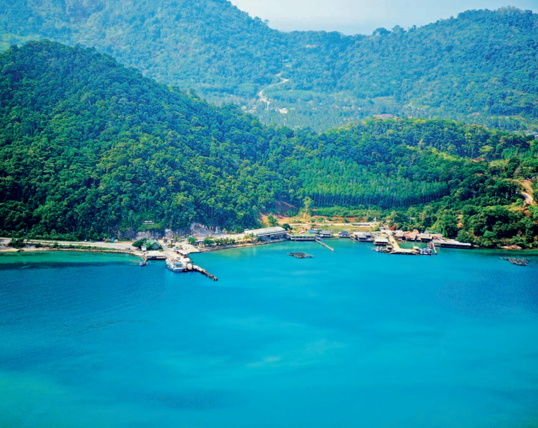
Ko Chang Ferry Pier

The schedules and fares are subject to change without notice due to climate condition. For current information, please contact TAT Trat office, Tel. +66 3959 7259-60.