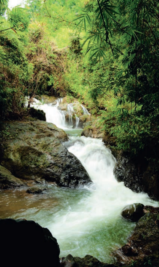
Namtok Khlong Phlu