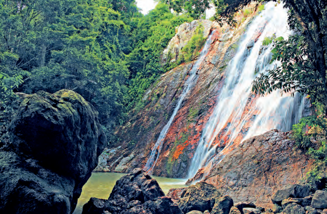
Namtok Na Mueang