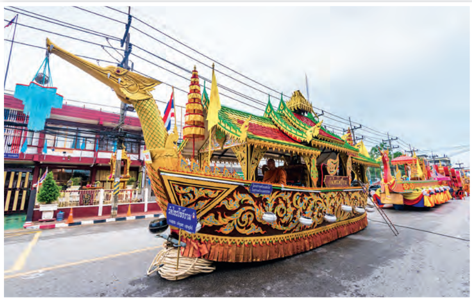
Chak Phra Festival

“Chak Phra” literally means “pulling the Buddha”, which takes place at the end of the Buddhist Lent in October when Buddha images from all the town’s temples are paraded along the streets, with the most important one floated with pride on the river. During this annual event, the local people offer new robes and daily necessities to the monks, while Tapi River becomes the scene of some exciting longboat racing.