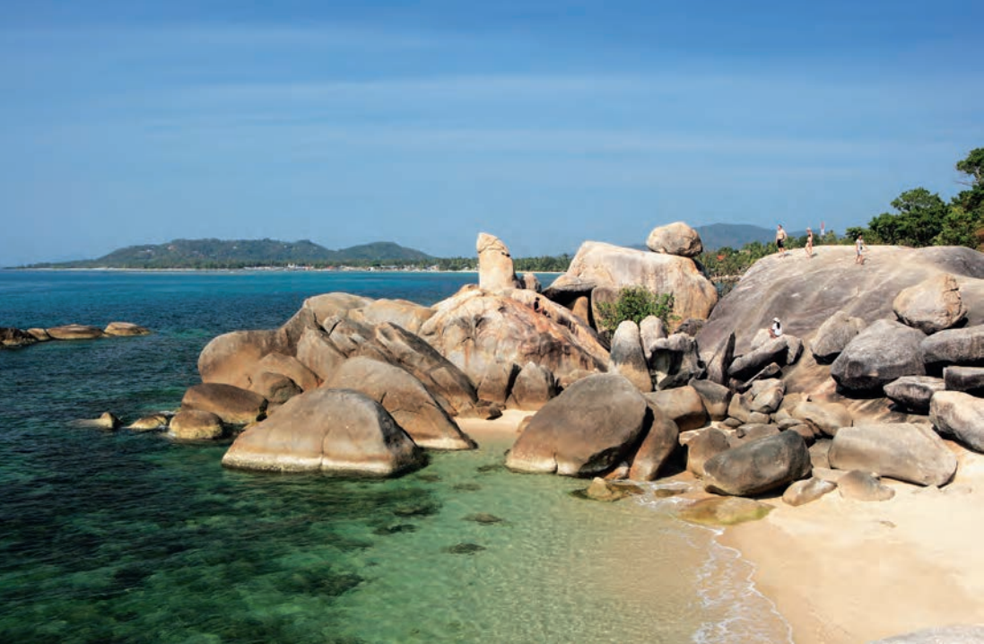
Hin Ta and Hin Yai

activities include windsurfing, jet-skiing or paragliding. Those who are not a water sports lover can enjoy relaxing at the beach or join in one of the spontaneous games of beach volleyball, or even Takro, a traditional Thai ball game, using feet, elbows and shoulders. If exploring the island's interior sounds like fun, hire a 4WD vehicle and try off-road driving on the bumpy trails leading to the highlands. Moreover, there are standard golf courses with sea view for you to enjoy golfing while taking in the seascape at the same time.