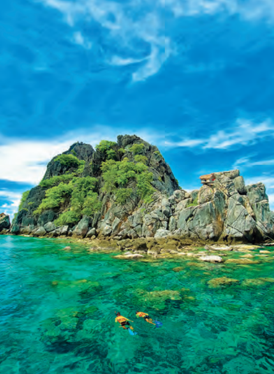
Ko Ngam Yai

Contact TAT Chumphon Office at Tel. +66 7750 1831-2, +66 7750 2775-6 for more information.