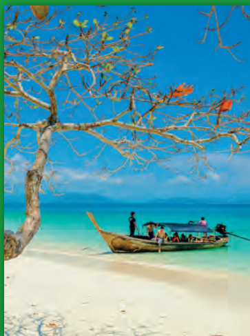
Laemson National Park