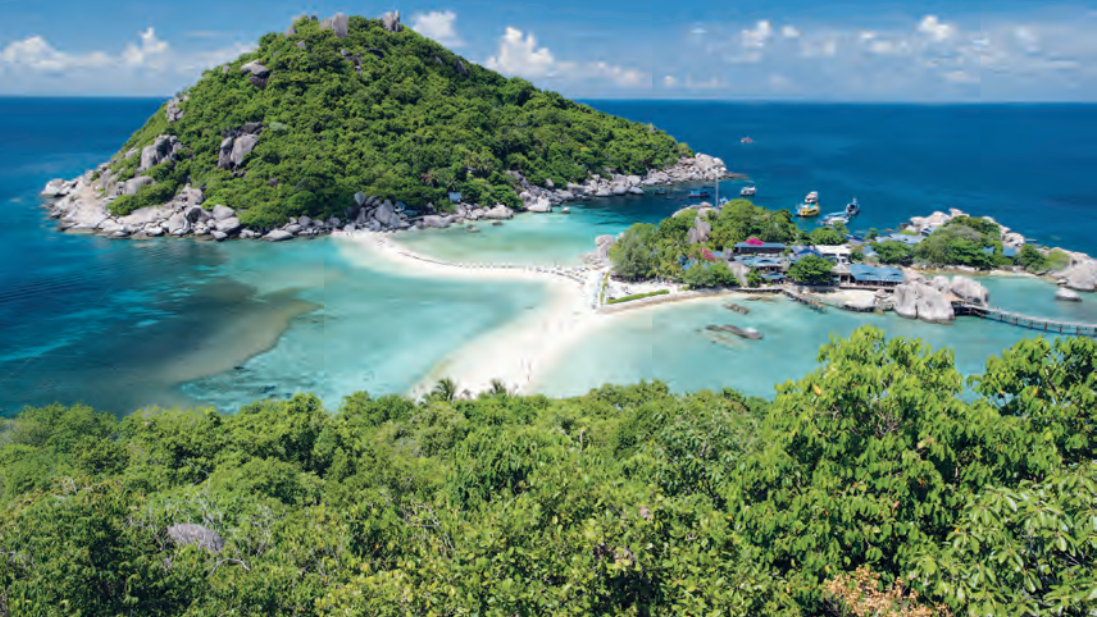
Ko Nang Yuan