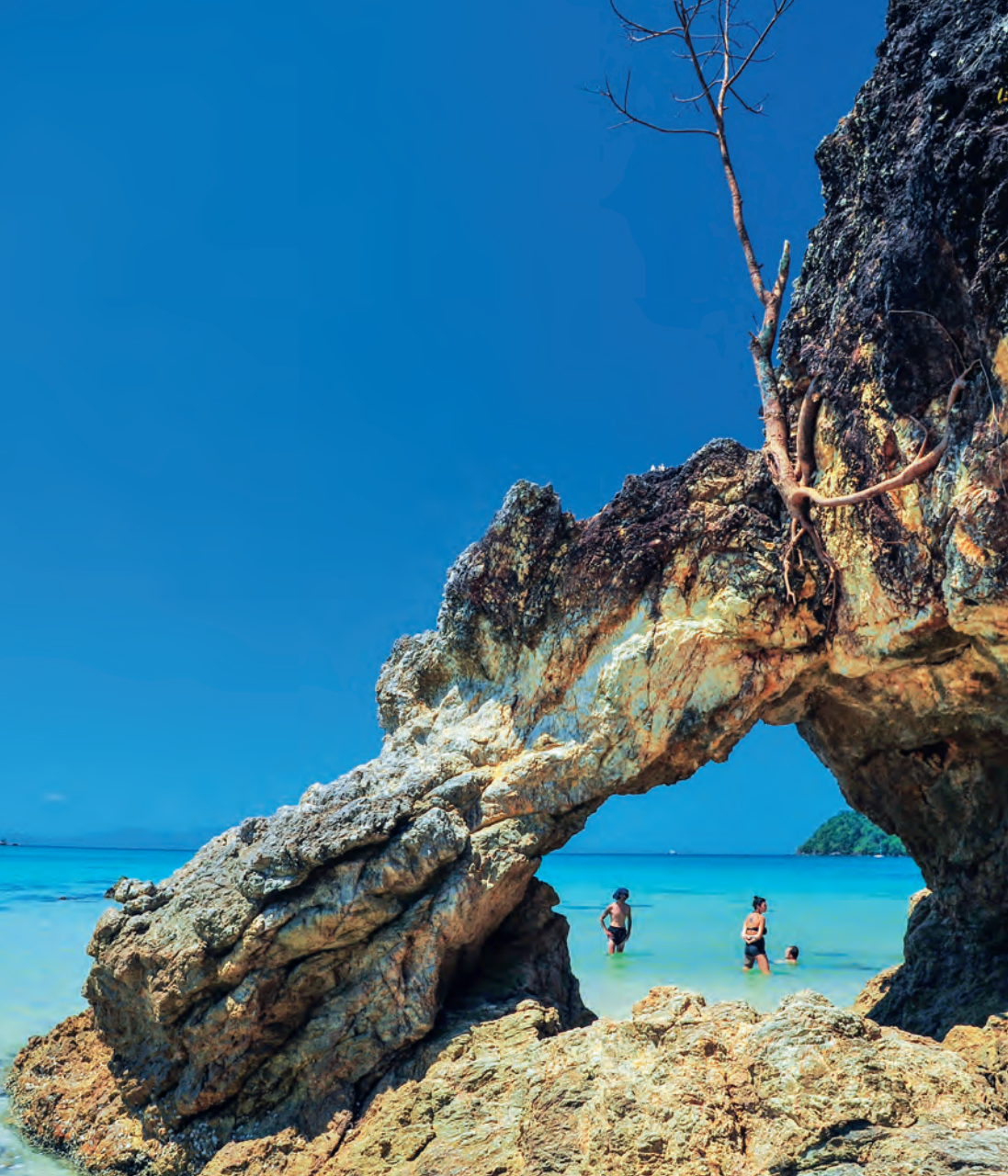
Ao Khao Khwai