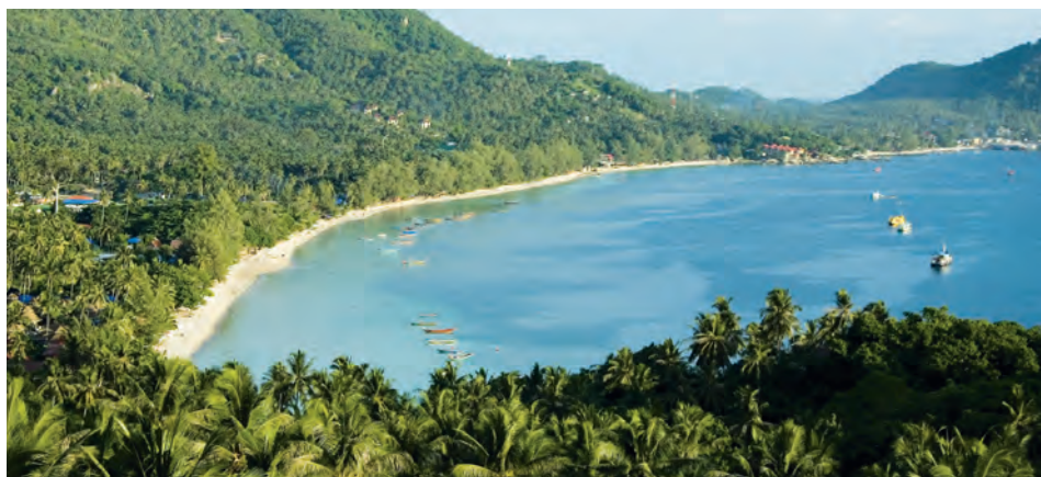
Hat Sai Ri

This small park, covering 317 sq. kms., has its headquarters 21 kms. south of town near Hat Sai Ri. Visitors may camp here and walk along trails that lead off from the Tourist Information Centre. The park includes beaches like Thung Makham and Arunothai, as well as over 40 small offshore islands. Several of them, like Ko Chorakhae and Ko Ngam, are surrounded by beautiful coral reefs, while Ko Thong Lang has a long white sand beach. Boat can be hired to travel around the surrounding islands and tent camping at the national park can also be done.