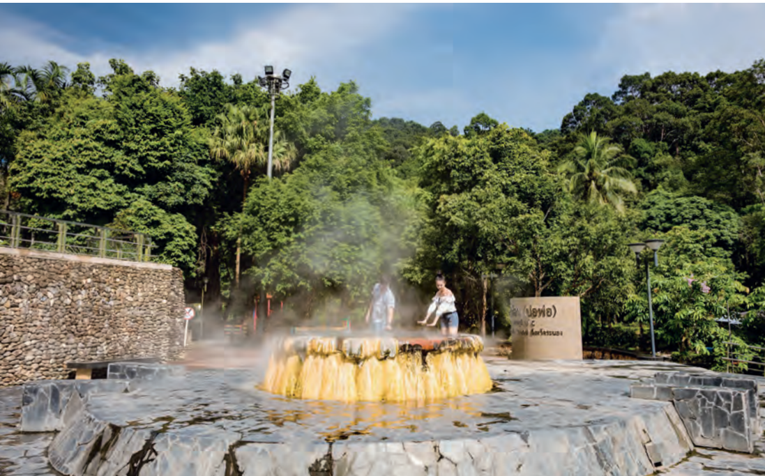
Ranong Hot Springs and Raksawarin Arboretum

Just 1 km. to the east of town, on the grounds of Wat Tapotharam, are some hot springs, which bubble out of the ground at a scalding 65-70 degrees Celsius. This is too hot to bathe in, but the rustic public baths are a much cooler at 42 degrees Celsius, while the nearby Jansom Thara Hotel has a large public spa that uses the same waters. The hot springs are surrounded by the Raksawarin Arboretum, where there are benches for relaxing in the shade, and from where it is possible to take elephant rides.