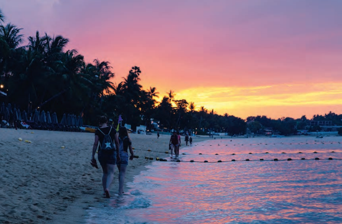
Hat Bo Phut