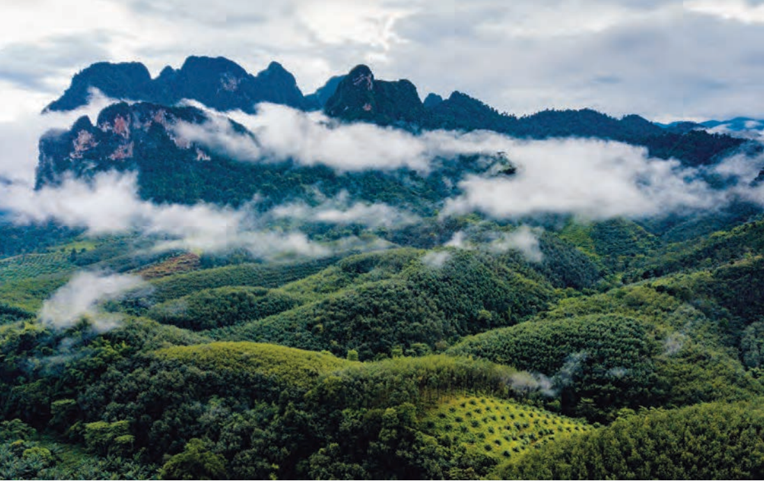
Khao Sok National Park