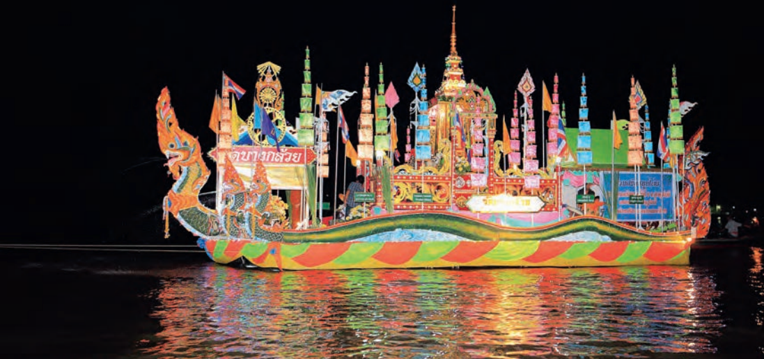
Chak Phra Festival