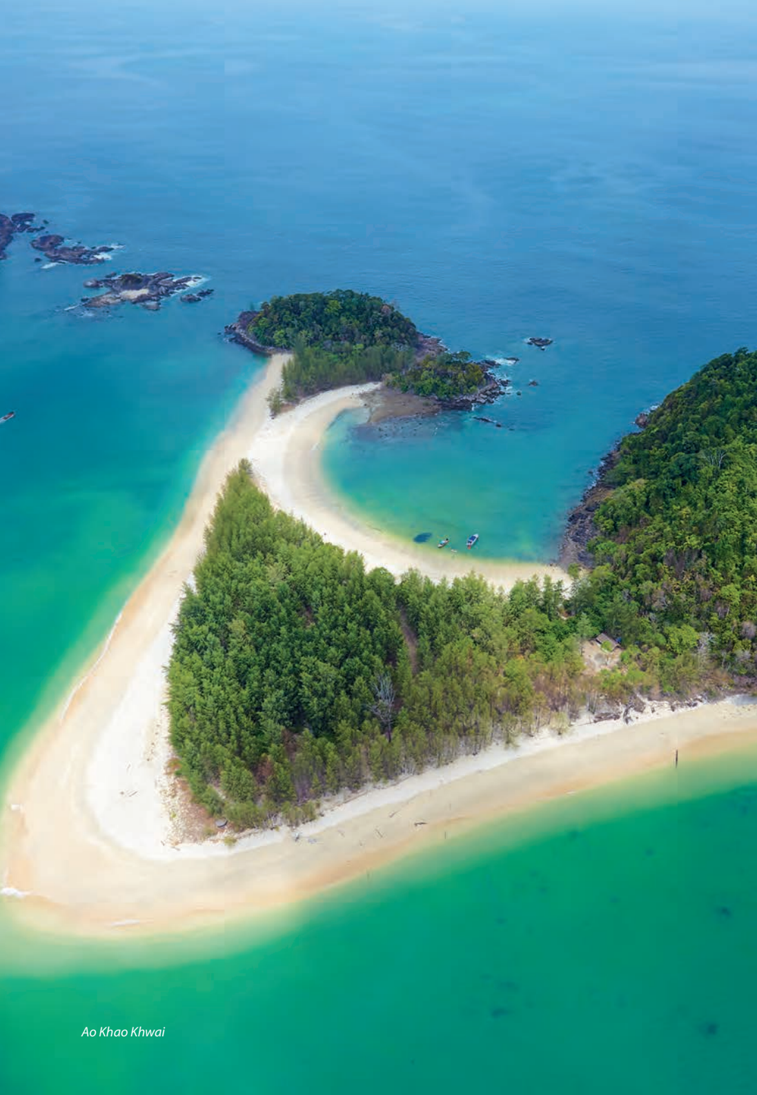
Ao Khao Khwai