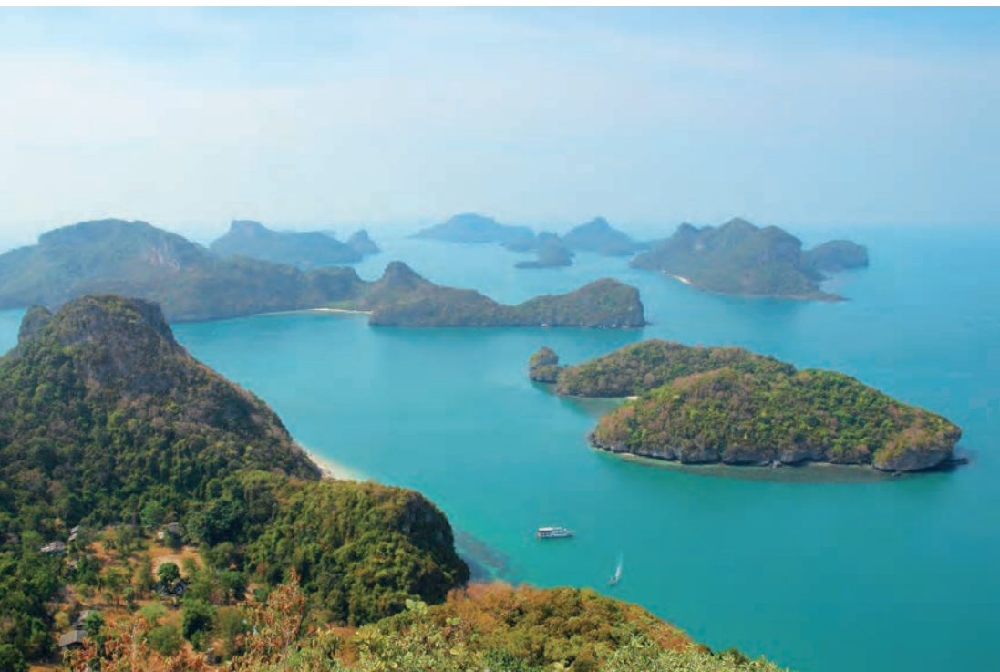
Muko Ang Thong National Park

Situated 20 kms. north of Ko Samui and a short boat trip away, Ko Pha-ngan is a mountainous island ringed by secluded bays that offer ideal getaways. The town centre of the island, Thong Sala has a bank, a post office, a supermarket and shops selling beach equipment and souvenirs. Many of its beautiful beaches are