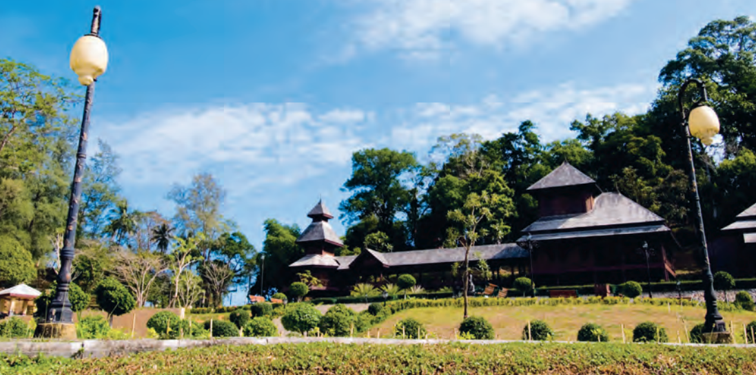
Rattana Rangsan Palace