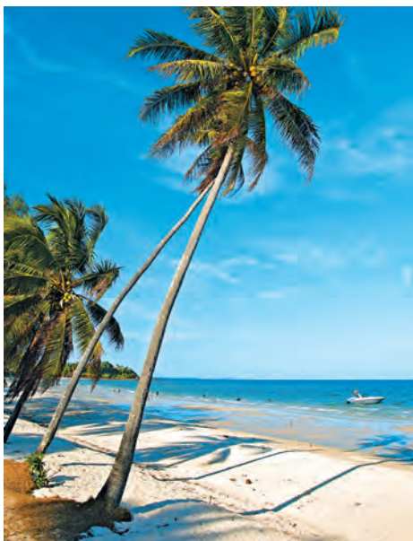
Hat Thung Wua Laen

Ask for recommendations on where to stay in Chumphon at the TAT Chumphon office Tel. +66 7750 1831-2, +66 7750 2775-6. Website: www.tourismthailand.org .