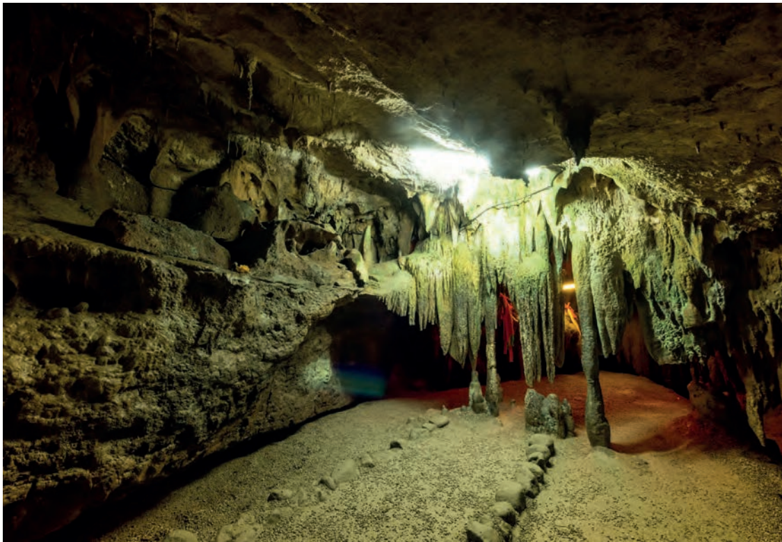
Tham Le Khao Kop

have to lie on your back to enter the small and concealed opening of the cave. Once inside, it is time to get off the boat and start exploring the beautiful caverns filled with spectacular stalactites and stalagmites. The caverns are lit with lightings to highlight the wondrous formations of nature. Towards the end of the journey, get back on the boat again and brace yourself for the experience of a lifetime. This last part of Tham Le Khao Kop resembles the dragon's torso, in which it is believed that travelling under the dragon's belly supposed to bring you good luck. As the boat progresses deeper inside the passage, the ceiling becomes lower and lower. The real adventure begins when you have to lie completely flat on your back in order to pass through the dragon's belly to exit the cave. Even the