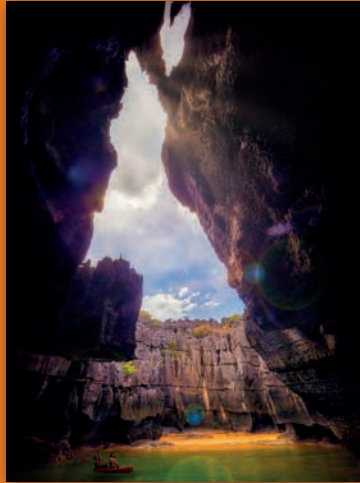
Ko Khao Yai