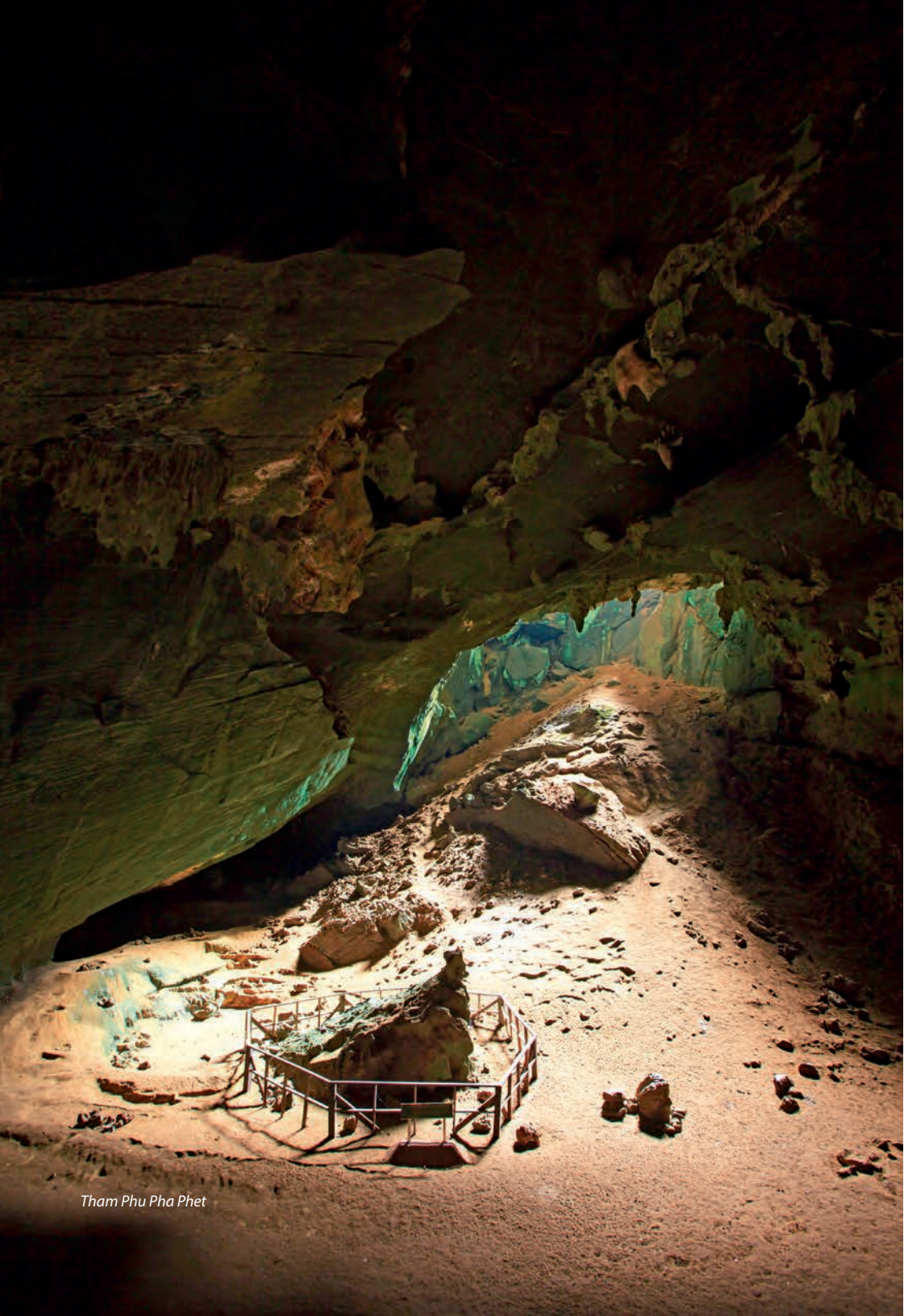
Tham Phu Pha Phet