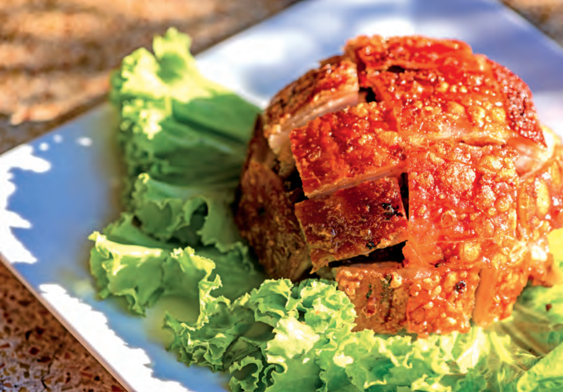
Trang Roast Pork

Remark: Dim Sum, Trang Roast Pork, Kopi, and Trang cake can be found throughout Trang, whereas the most famous place for seafood indulgence is Hat Samran. Locals usually visit Hat Samran, a tranquil beach shaded by rows of pine trees not only for relaxation, but also for its fresh and scrumptious seafood dishes served by several restaurants that lined the beach.