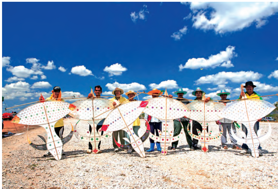
Hua Khwai Kite