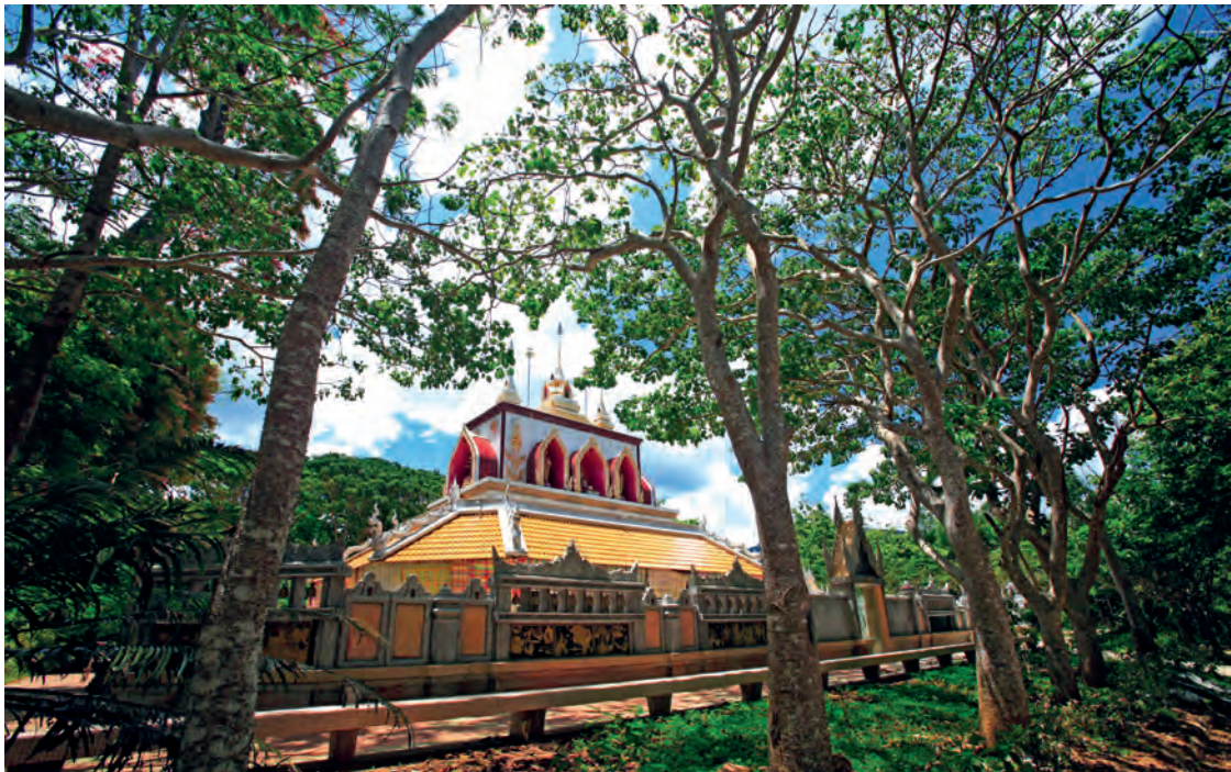
Wat Phukhao Thong

Location: Tambon Kantang, Amphoe Kantang, Trang