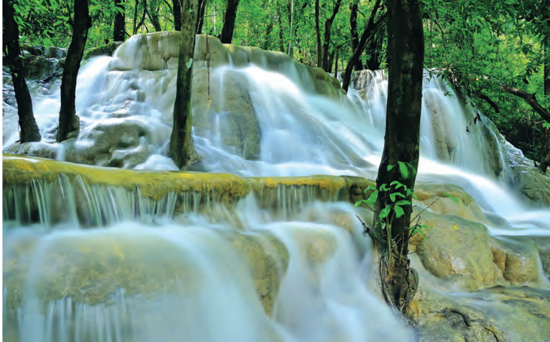
Namtok Wang Sai Thong

sponges, and crinoids. Every year, around February, the mysterious Khao Thanan becomes lively with fields of countless spellbinding sunflowers, and whoever pays a visit gets to immerse in the beauty of the bright and sunny flowers against the backdrop of the towering limestone mountain.