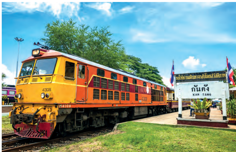
Kantang Railway Station