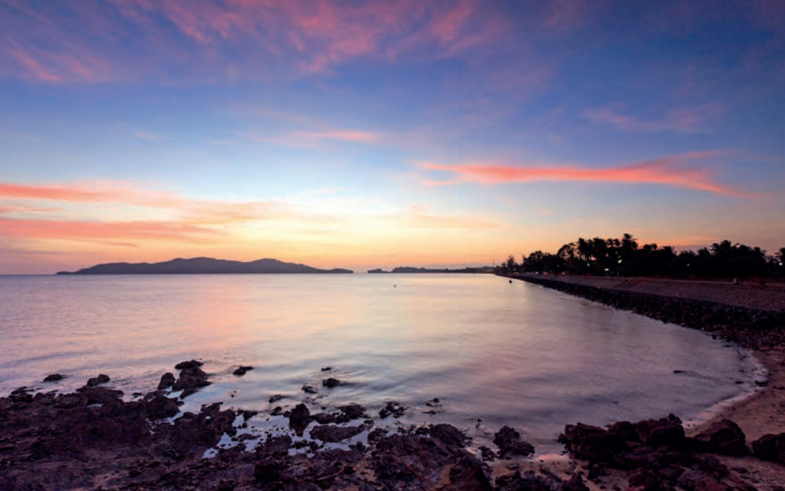
Hat Pak Bara

enthusiasts would have a blast with the kayaking activity along the waters of Khlong Lam Lon. Once everyone is suited up with a life jacket and a helmet, it is time to go on an adventure. The 8-kilometre-long trip takes a little over 2 hours in which the kayak passes through 16 exciting rapids, some with narrow and sharp corners that makes the trip all the more thrilling. The kayaking trip also gives you the rare opportunity of visiting the Mani ethnic group, who is the only Negrito group in Thailand and lives in the forests with distinctive traditions and way of life.