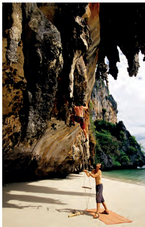
Climbing at Ko Lao Liang

Located not far from Ko Lao Liang are Ko Phetra and Ko Takiang , both of which offers remarkable underwater world where a day trip to these islands allow divers and snorkellers to embark on the finding nemo journey and swim with these adorable creatures. After coming back from the day trip, end the day by hopping on a boat to watch the spectacular sunset over the sea with vibrant colours.