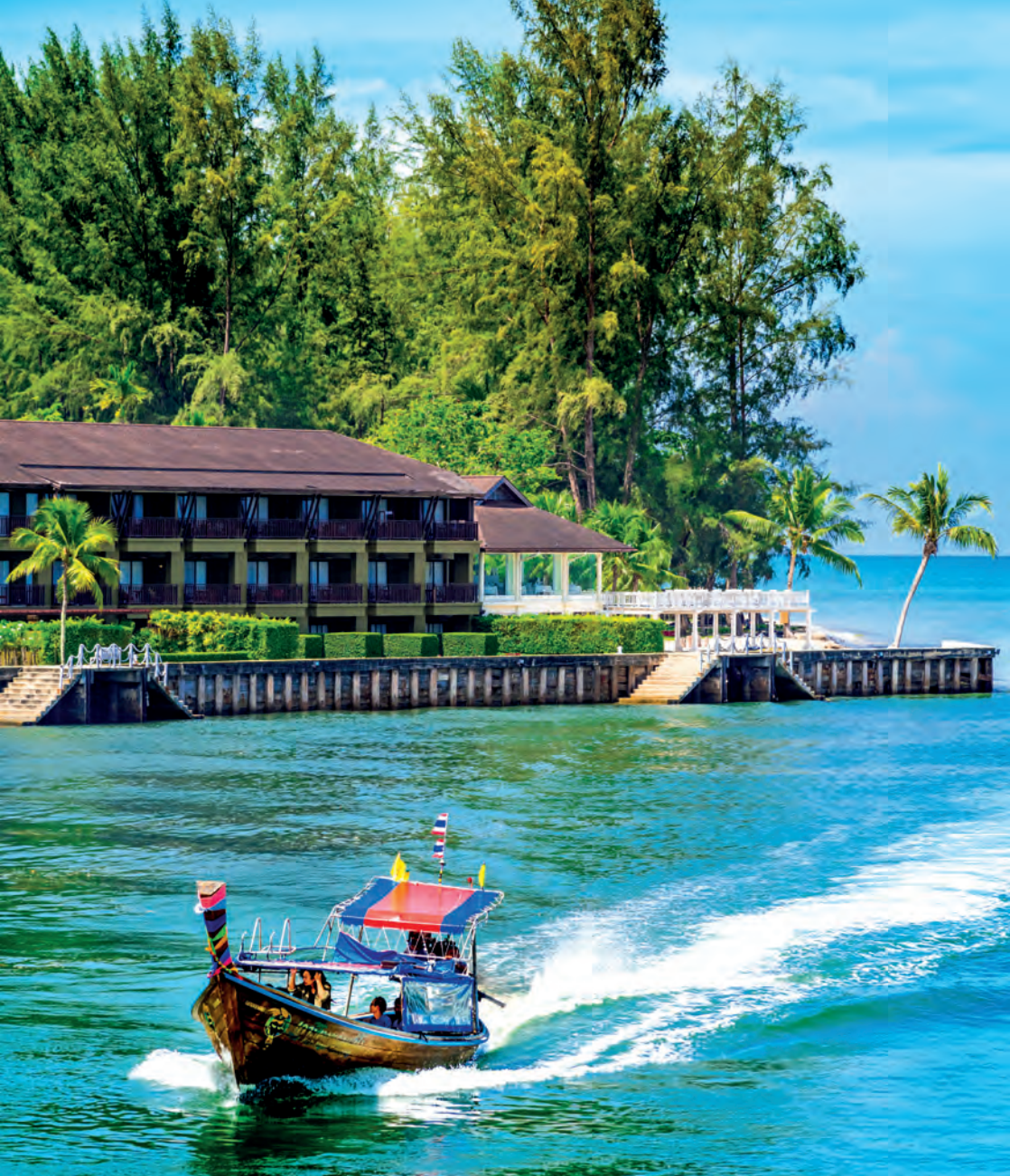
Chang Lang Bridge