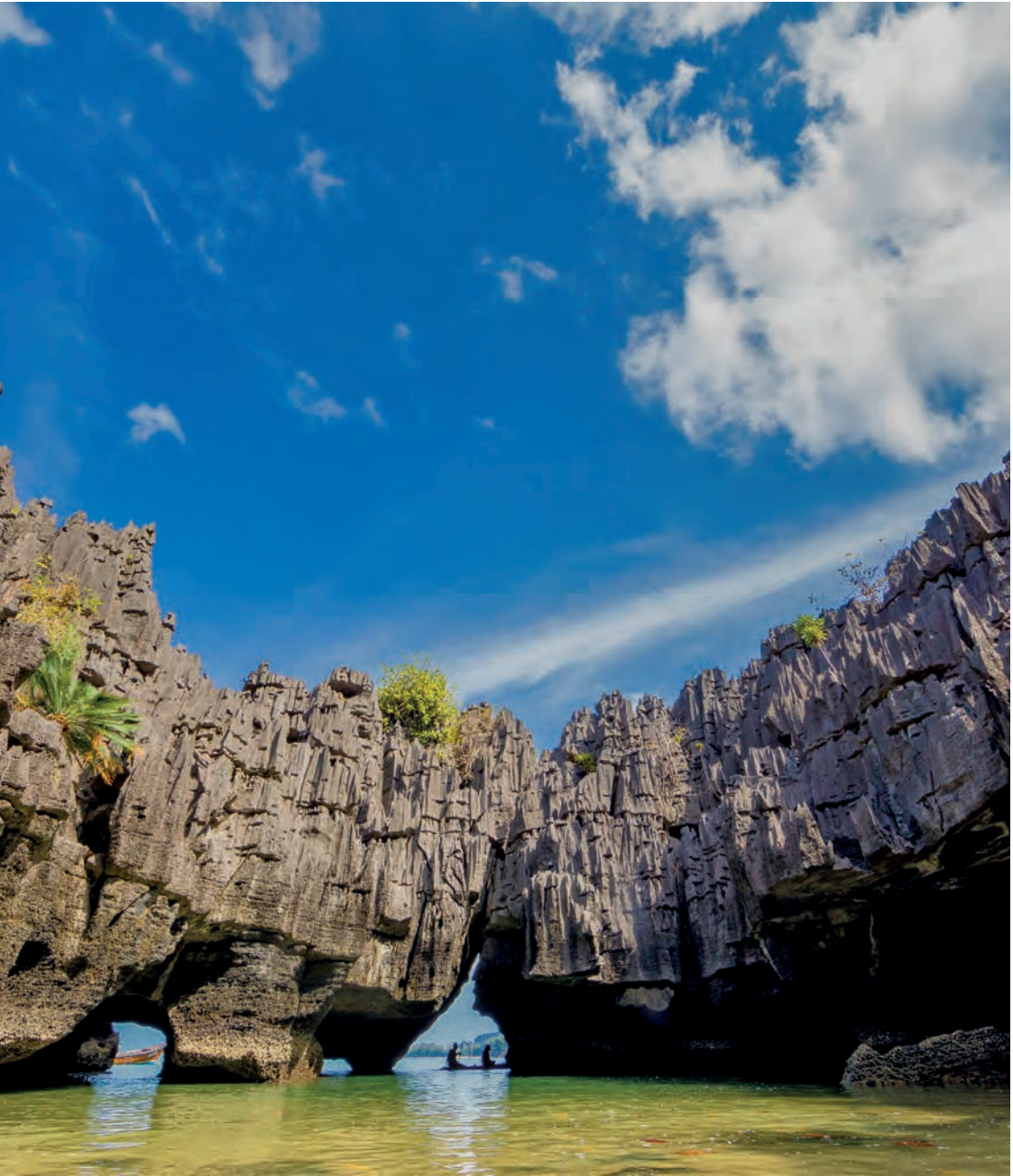
Prasat Hin Phan Yot