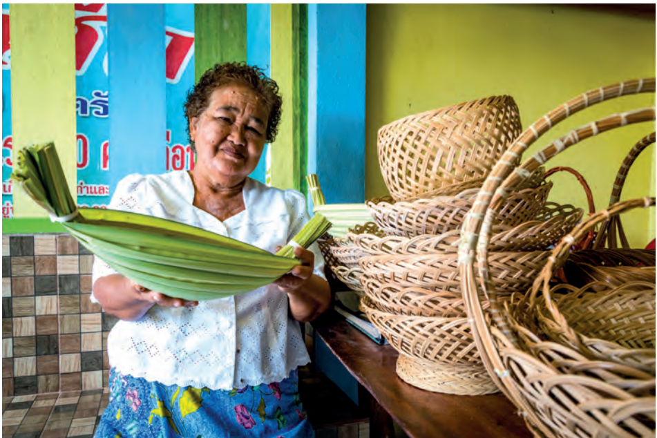
Ban Yan Sue

'Pak Kat Tin Thip' is Thai translation for the idiom 'Living from hand to mouth', and is also the nickname of Ban Yan Sue, a small village by the Trang River. Ban Yan Sue has the biggest nipa palm forest in Trang, and nipa palm tree is therefore an important part of the village life. The reason behind the nickname was simple, as the literal translation of 'Pak Kat Tin Thip' is