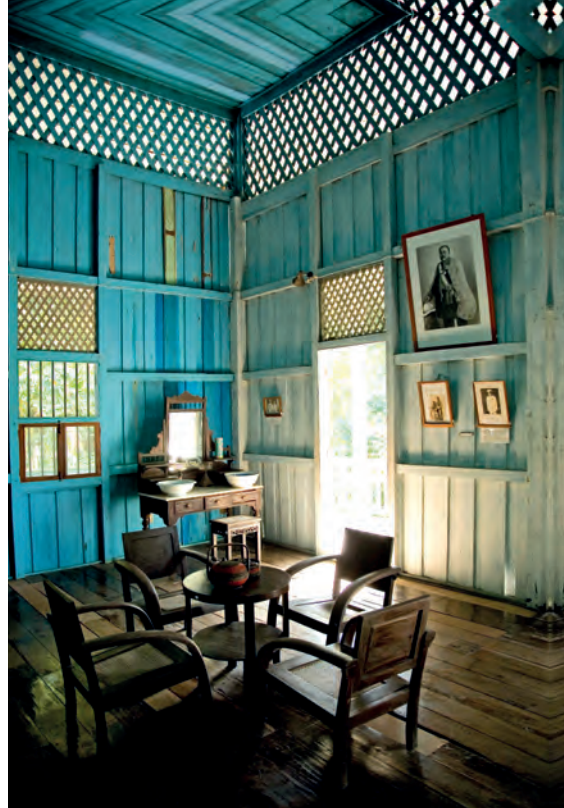
Phraya Ratsadanupradit Mahison Phakdi Museum

Although walking up to the top of Khuan Tamnak Chan Public Park that is situated on a hill is a tiring exercise, the greenery of the