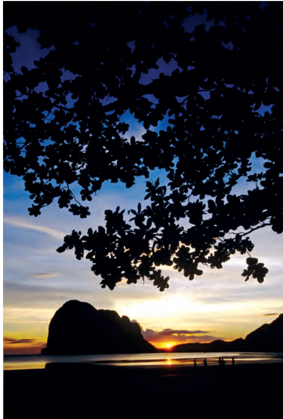
Hat Pak Meng

Listening to the waves lapping the shoreline in synchronisation with the wind blowing through the pine trees that fringed the beach makes a late afternoon stroll along Hat Pak Meng a pleasant experience. The 5-kilometre-long beach is in a crescent moon shape and the local families usually come here for recreational activities; such as, swimming in the warm water or building sand