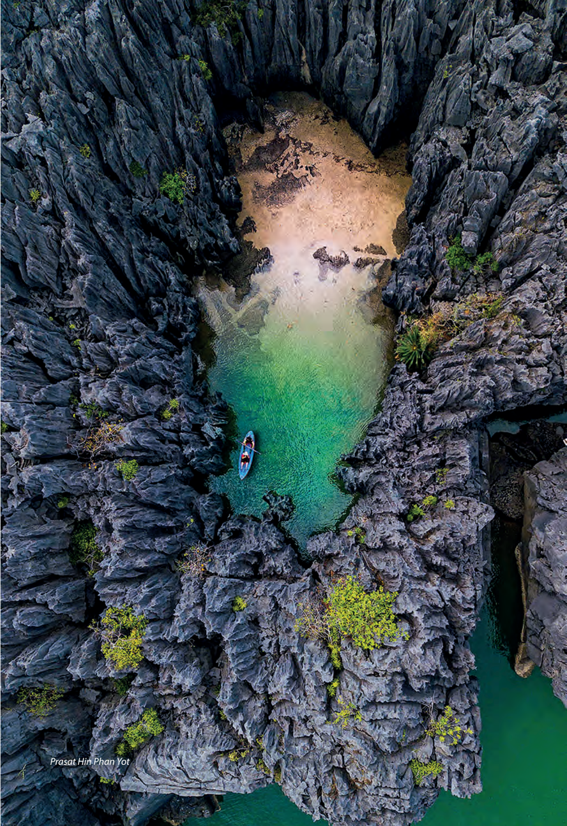
Prasat Hin Phan Yot