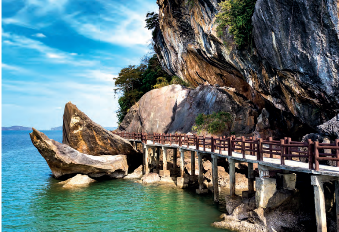
Khao To Ngai

breeze from the sea touches the skin. As the ' Khao To Ngai Fault Plane ' or the 'Time Travel Zone' appears before the eyes, the fault plane on the seafront cliff that is separated by twenty million years send chills down the spine. Feel the time slows to a pause while admiring the natural wonders where the red sandstone of the Cambrian period (around 541 to 485 million years ago) comes into contact with limestone of the Ordovician period (around 485 to 444 million years ago).