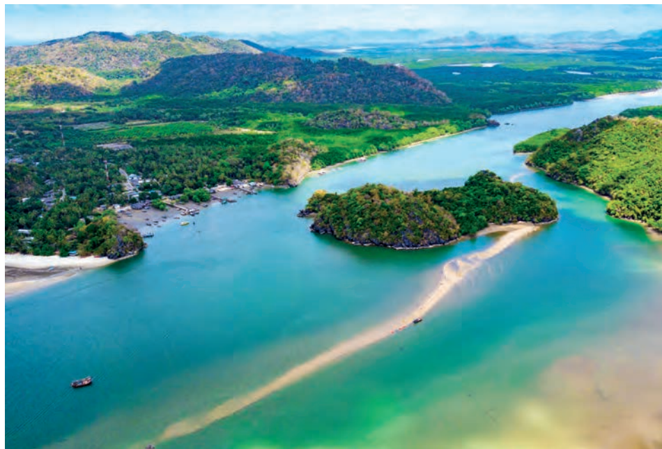
Hat Sanlang Mangkon

down, take a moment to bask in the beauty of the nature as the sky slowly changes its colours and the daylight starts to fade. After the sun slips behind the horizon, get on the bike and go to a nearby restaurant to enjoy a nice seafood meal while savouring the enchanting evening sky after sunset.