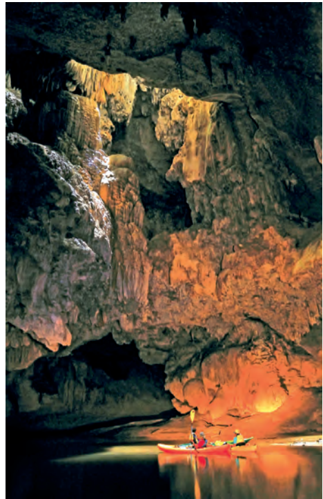
Tham Chet Khot