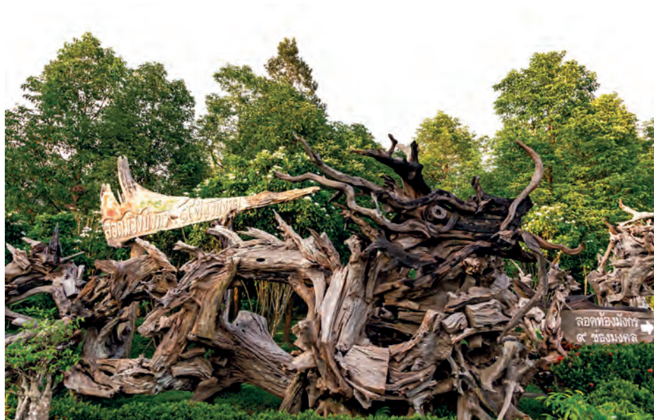
Wang Thep Tharo Learning Centre