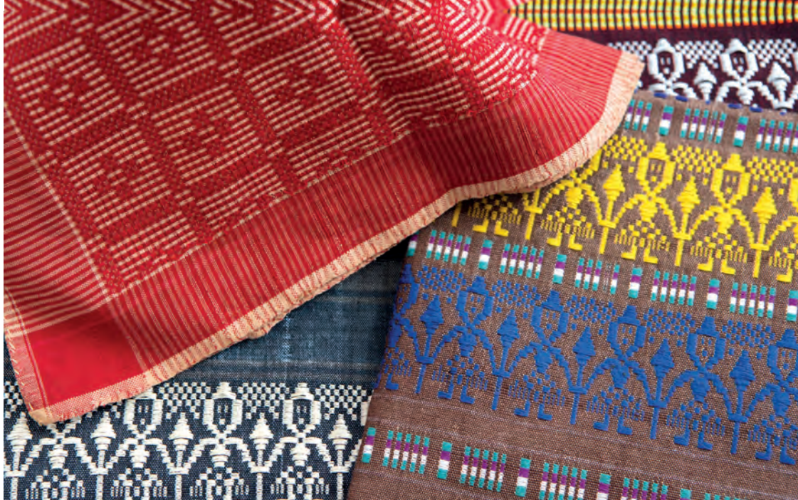
Na Muen Si Weaving Group

Buddha statues that are placed along the way. The 172 steps lead to a magnificent golden pagoda called 'Chedi Bua Ngoen Bua Thong' that enshrines a golden Buddha image named 'Phra Yot'. Pay respect to Phra Yot before walking up another flight of steps to pay homage to the replica of the Lord Buddha's footprint. At this point, one can also view the beauty of the natural surroundings, as well as see the view of Chedi Bua Ngoen Bua Thong from above. Those who are adventurous can take up the challenge of hiking up the narrow steps up the side of the mountain, in which at some point you need to pull yourself up with a chain and climb through arches of rock, to the viewpoint. From the viewpoint, you can get the 360-degree view of Amphoe Huai Yot, and it is a perfect spot to take a moment to restore the peace of mind while savouring the intriguing beauty of nature that surrounds Khao Phra Yot. The scenery from the viewpoint is particularly