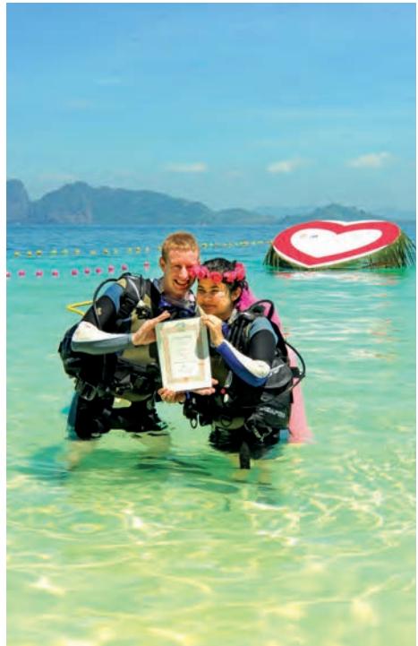
Trang Underwater Wedding Ceremony

Contact Information: Na Muen Si Sub-district