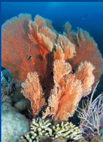
Muko Phi Phi National Marine Park, Krabi