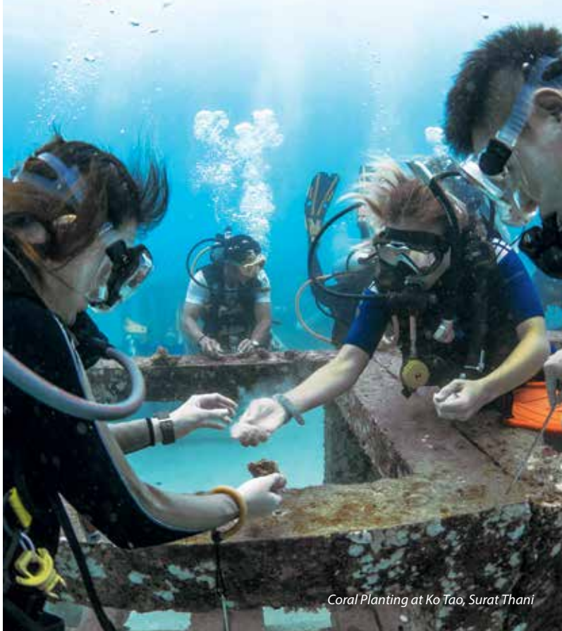
Coral Planting at Ko Tao, Surat Thani

Do not stand on, touch, or remove items from the reef, including coral.