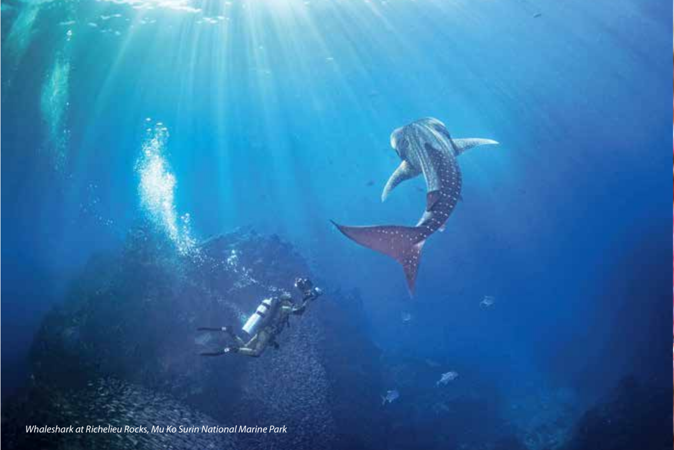
Whaleshark at Richelieu Rocks, Mu Ko Surin National Marine Park