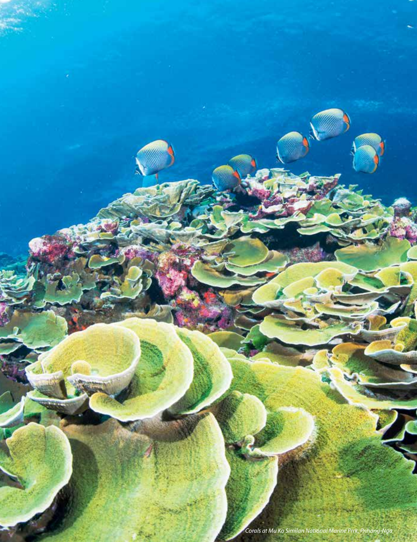
Corals at Mu Ko Similan National Marine Park, Phang-Nga

For more information, visit www.tourismthailand.org or contact the Department of National Parks, Wildlife and Plant Conservation at +66 2579 6666, +66 2561 0777 or visit www.dnp.go.th .