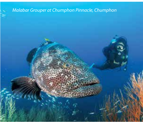
Malabar Grouper at Chumphon Pinnacle, Chumphon

Diving in Thailand is possible at all times of the year, depending on the seasons of the different areas. On the west side of Thailand is the Andaman Sea, best visited from October to April. Here, popular dive sites are found in Phuket, Muko Similan, Muko Surin, Krabi, and Trang provinces. On the East coast is the Gulf of Thailand and this is most suitable for diving from May to September. Examples of the dive sites here are Ko Samui, Ko Pha-ngan, Ko Tao, Ko Nang Yuan, Ko Chang, and Muko Ang Thong Marine National Park. Snorkelling trips are offered on almost every island and are usually combined with sea kayaking and picnics on the islands or in the national parks.