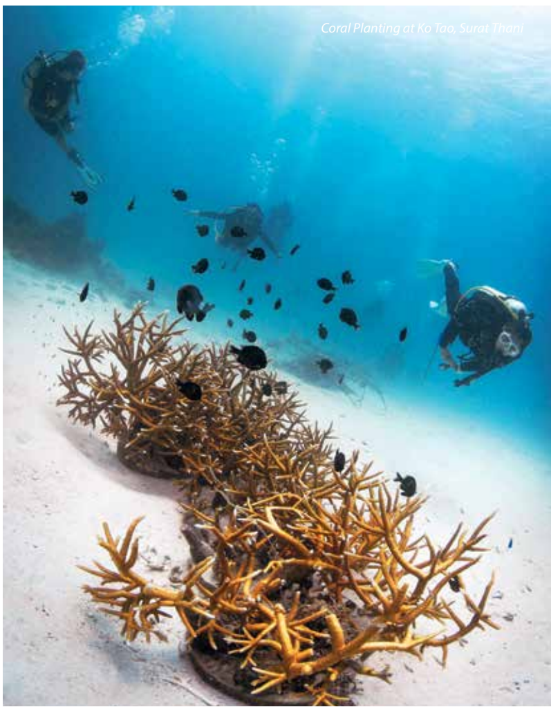
Coral Planting at Ko Tao, Surat Thani