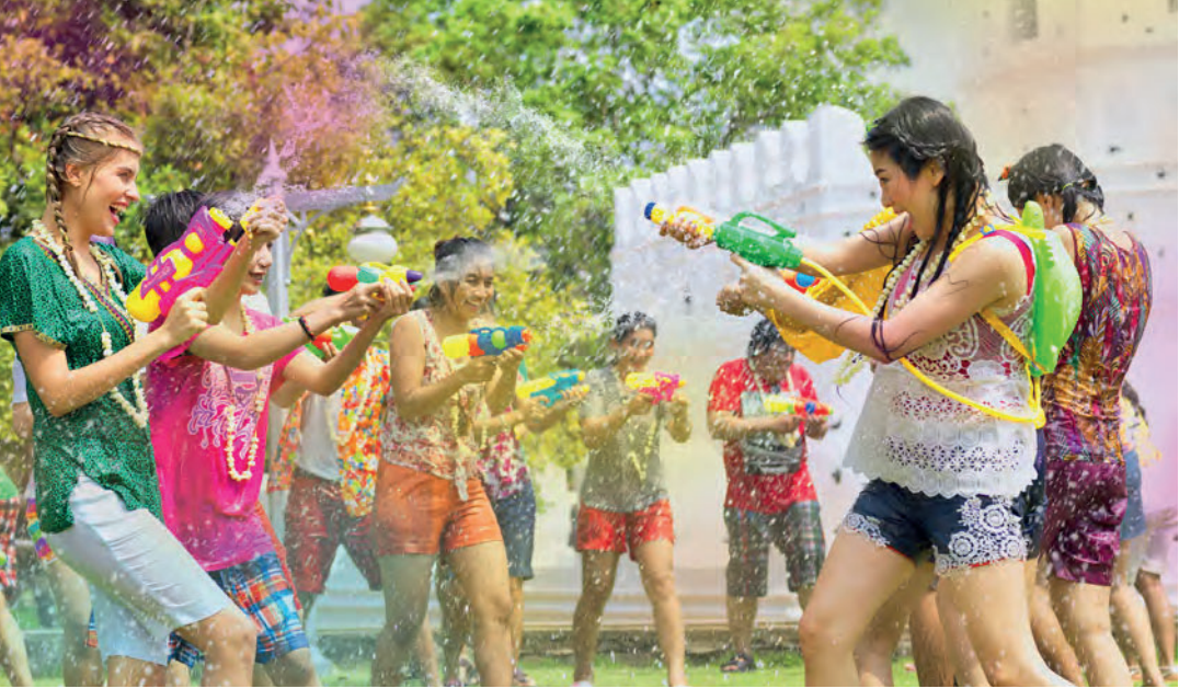
Bangkok Songkran Festival