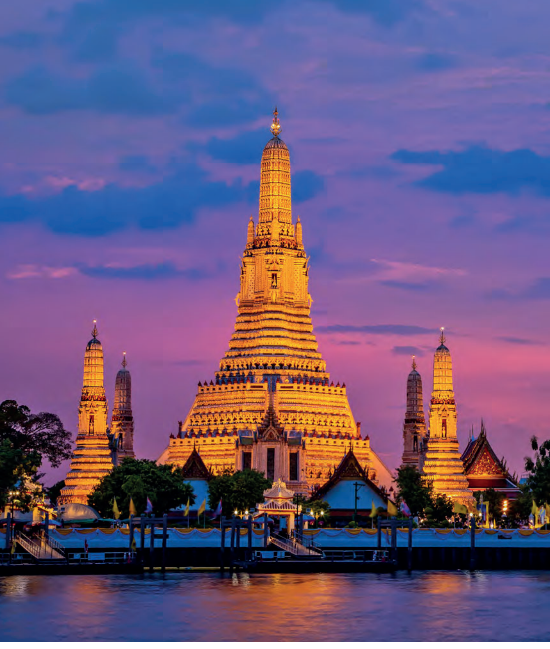
Wat Arun (The Temple of Dawn)