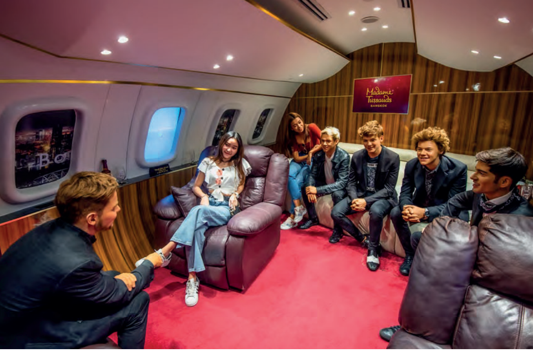
Madame Tussauds Bangkok