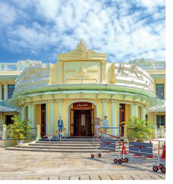
Oueen Sirikit Museum of Textiles

for royal ceremonies to be announced later. Visitors are advised that polite and modest dress is essential. Tel. +66 2224 3290 Website: www.palaces.thai.net Admission fee: 500 Baht.