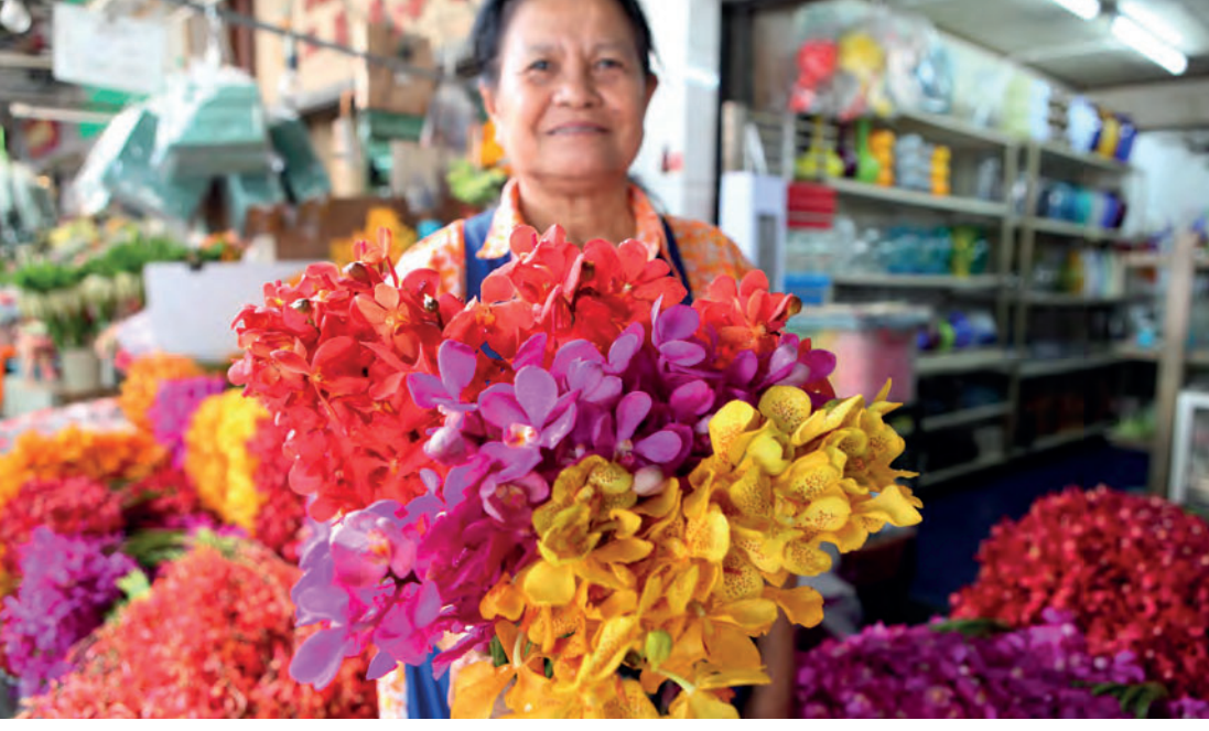
Pak Khlong Talat or Yodpiman (Flower Market)