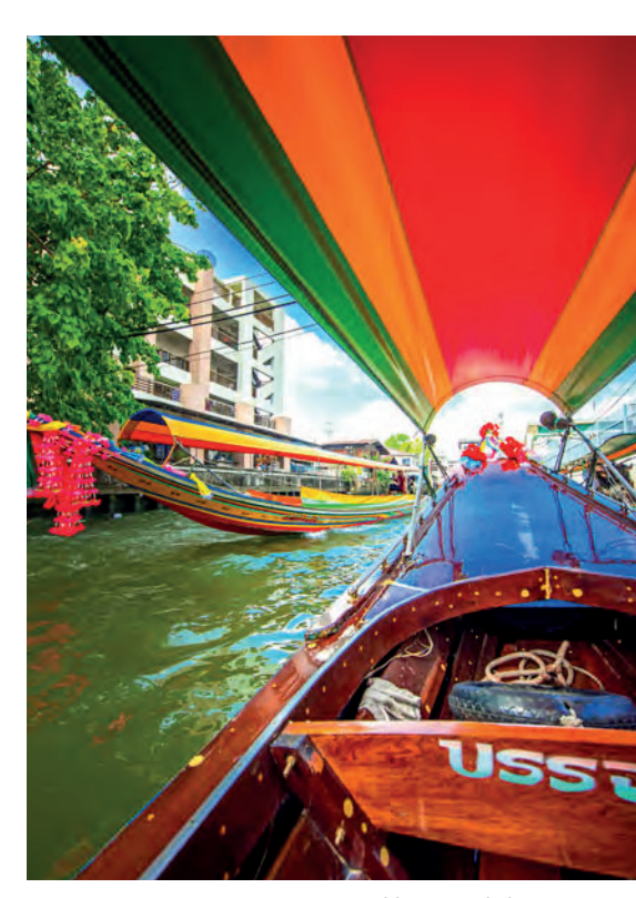
Khlong Bangkok Yai

Ferries leave Tha Chang Pier near the Grand Palace every 20 minutes between 6.15 a.m. and 8.00 p.m. Visitors will enjoy various scenic attractions including canal-side temples, the Royal Barge Boat Shed, Thai-style houses and the early morning Khu Wiang Floating Market which operates between 4.00 a.m. and 7.00 a.m.