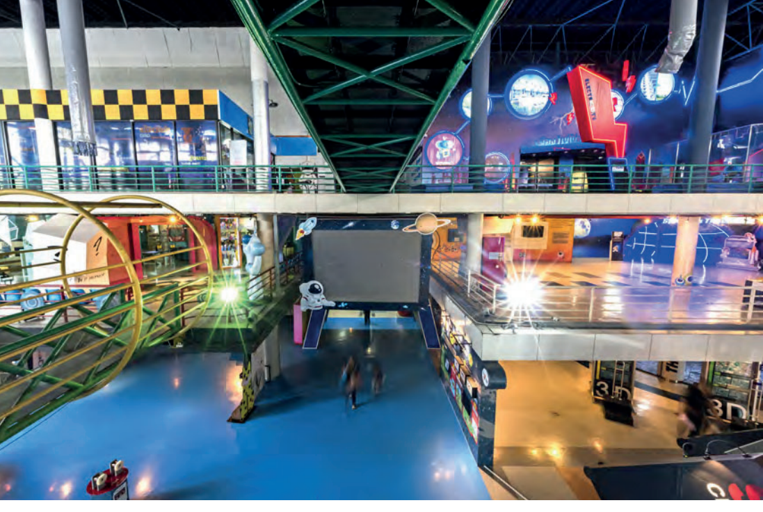
Science Centre for Education

enough, move on to the Museum of Parasitology. The museum is fascinating, but only for those who have a very strong stomach. It is open from 10.00 a.m. to 5.00 p.m. on Monday to Saturday. Tel. +66 2419 2601-2, +66 2419 2618-19 www.sirirajmuseum.com (except on Tuesday and public holiday.) Admission fee: 200 Baht.