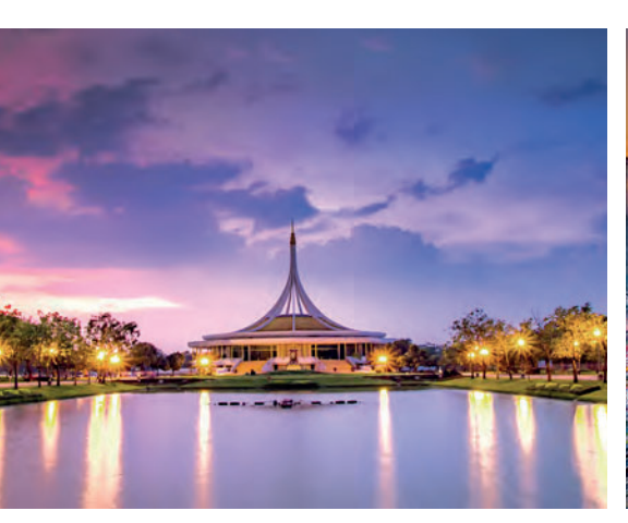
Suan Luang Rama IX Park