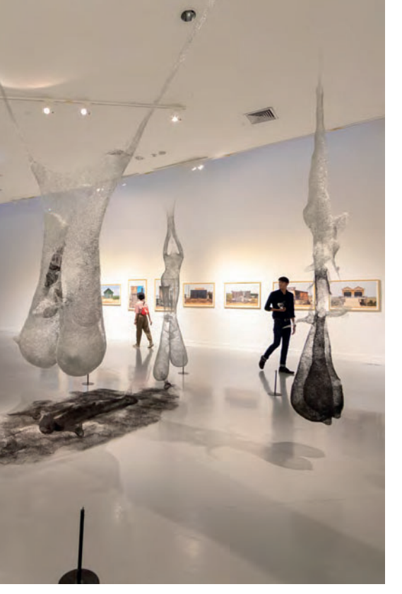
Bangkok Art and Culture Centre