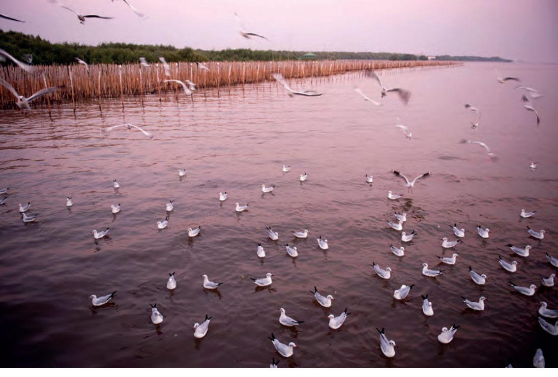
Bang Pu Seaside

Highway and open everyday from 9.00 a.m. to 7.00 p.m., contains almost-real-scale replicas of religious complexes, monuments and buildings found throughout Thailand. Tel. +66 2323 4094-9 Website: www.muang boranmuseum.com