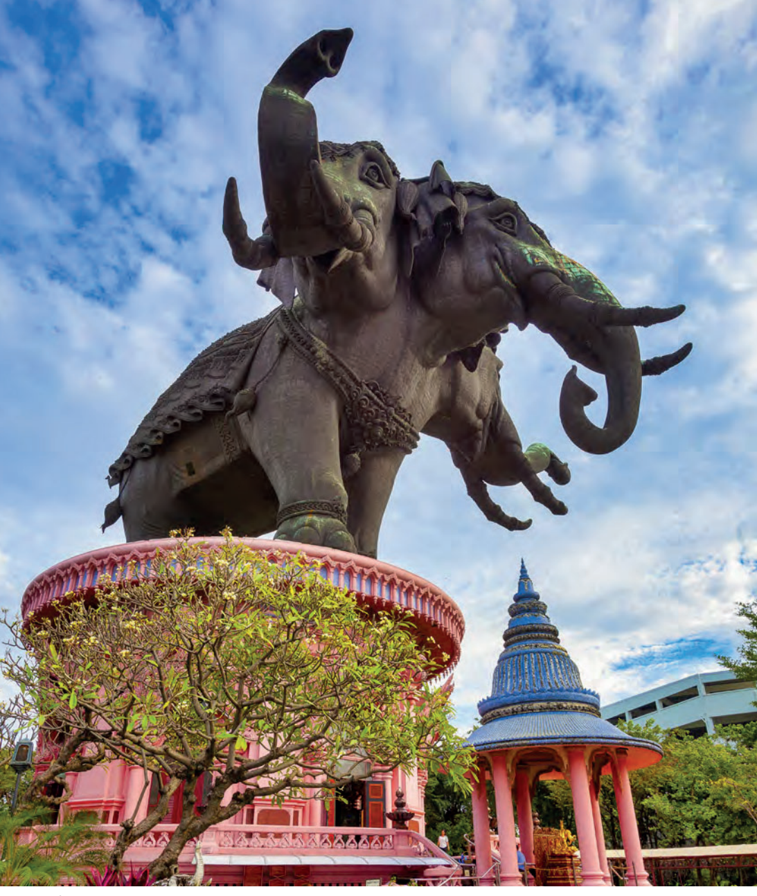
The Erawan Museum