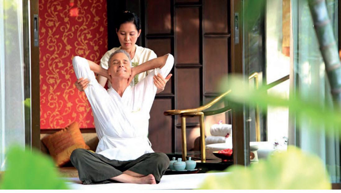
Traditional Thai Massage