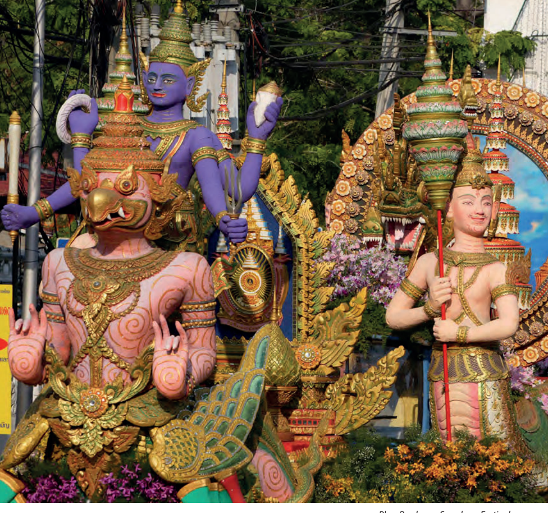
Phra Pradaeng Songkran Festival

dangerous animals. The farm opens everyday from 8.00 a.m. to 6.00 p.m. Tel. +66 2703 4891-5, +66 2703 5144-8