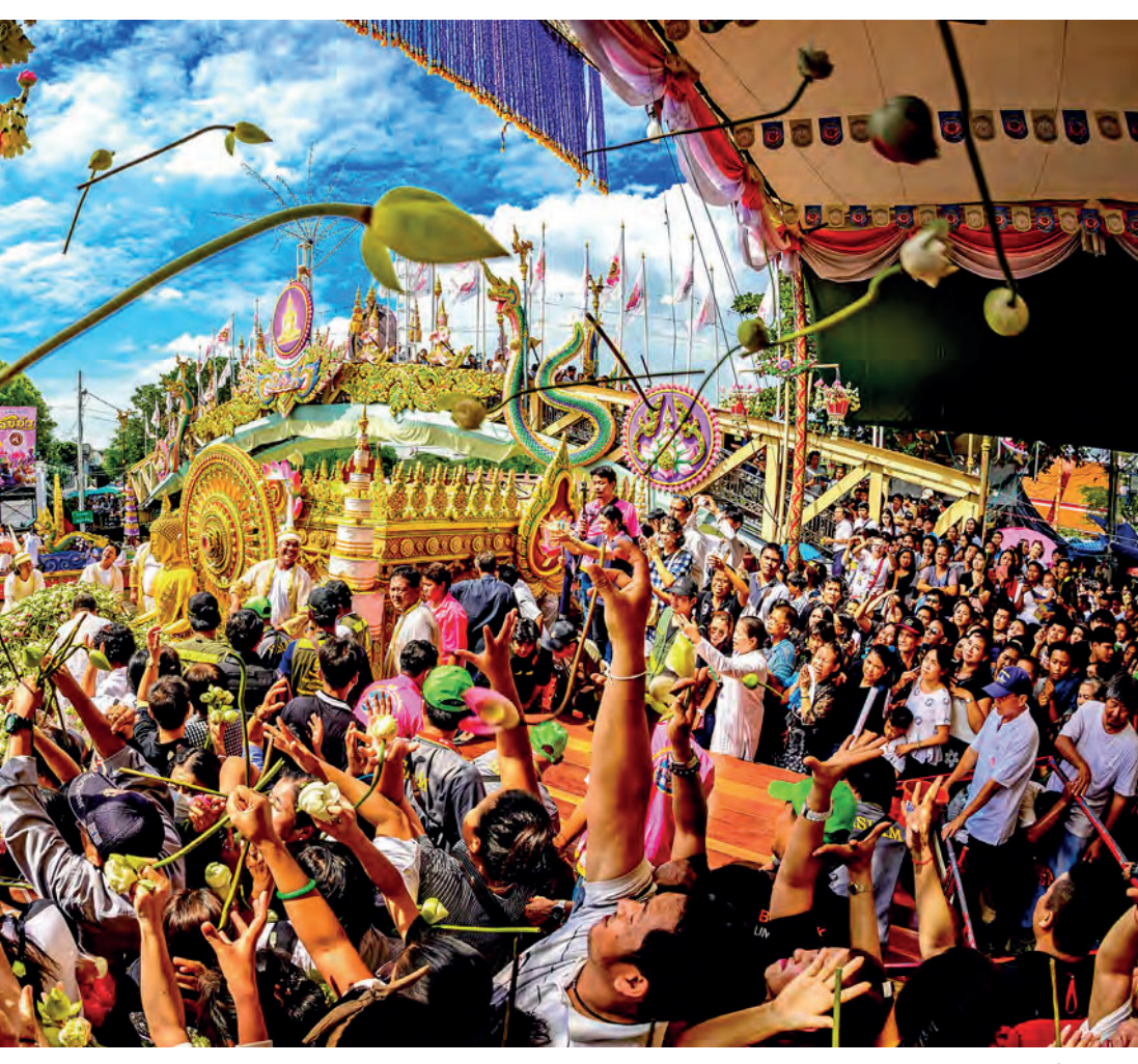
Yon Bua Festival

(Phra Pradaeng - Bang Lamphu), Line No. 13 (Rangsit - Phu Chao Saming Phrai), Line No. 20 (Pom Phra Chun- Tha Nam Din Daeng), Line No. 23 (Sam Rong – Thewet via Express way), Line No. 25 (Pak Nam - Tha Chang), Line No. 45 (Sam Rong - Ratchaprasong), Line No. 82 (Phra Pradaeng - Bang Lamphu), Line No.