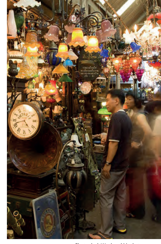
Chatuchak Weekend Market

Better known as the "Thieves Market", located between Yaowarat Road and Charoenkrung