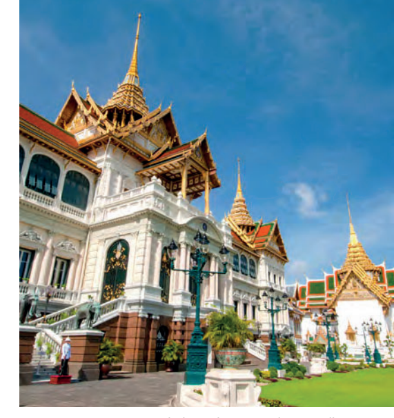
Chakri Maha Prasat Throne Hall, The Grand Palace

Bangkok takes great pride in its large number of fascinating temples around the capital. The major ones can be found in the Rattanakosin