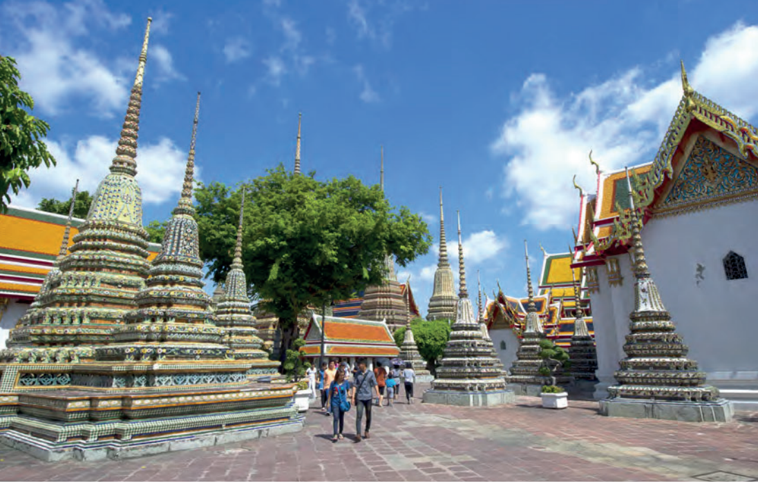
Wat Pho (The Temple of the Reclining Buddha)

an important centre for the teaching and administering of traditional Thai massage. Wat Pho is open everyday from 9.00 a.m. to 5.00 p.m. Modest attire is required. Tel. +66 86563 6255, +66 2622 3551 Website: www. watpomassage.com