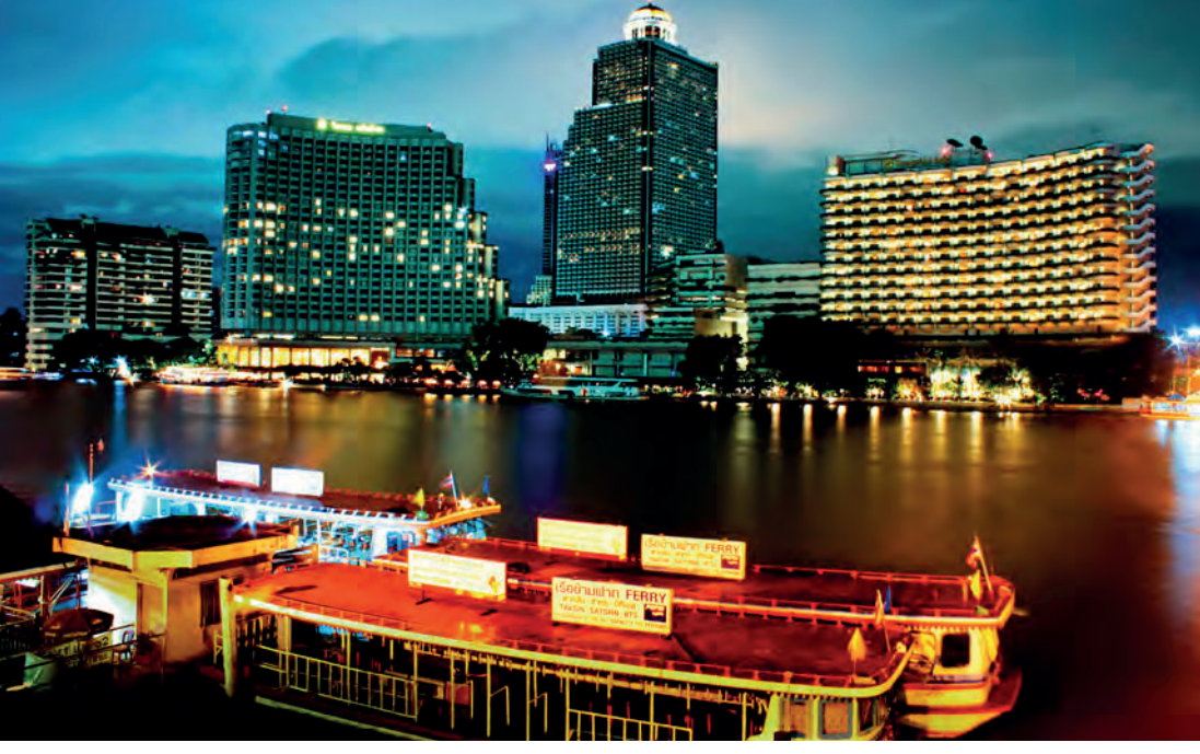
Chao Phraya River Dinner Cruises

fine arts, applied arts, creative design, literature, music, and motion pictures exhibitions. The facilities of the centre include a gallery space, an auditorium, meeting rooms, multi-function hall, art library and outlets. Open on Tuesday – Sunday from 10.00 a.m. – 9.00 p.m. For more information, visit www.bacc.or.th. or Tel. +66 2214 6630-8.