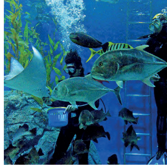
Sea Life Bangkok Ocean World

The biggest aquarium in Southeast Asia, Siam Ocean World was awarded the outstanding recreation tourist site, Thailand Tourism Award 2008. Covering an area of over 10,000 square metres, this aquarium features a 270-degree acrylic under ocean tunnel, a panoramic oceanarium with a 360-degree view through a 10.5-metre diameter fishbowl, and an 8-metre deep reef tank. Over 400 species of marine animals are displayed; including, Blue Ring Octopus, Gray Nurse Sharks, Leafy Sea Dragons, and Giant Spider Crabs. Located at Siam