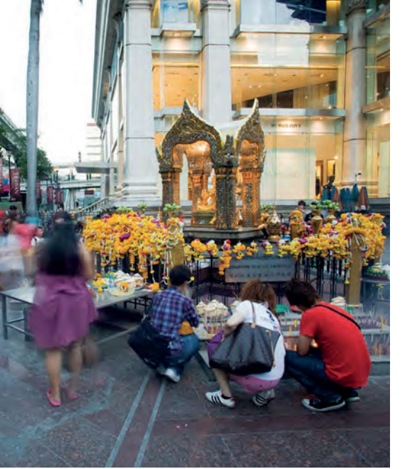
The Erawan Shrine

who could swing the highest to seize a money bag from a 25-metre-high pole. But the contest was outlawed many years ago, when accidents and deaths became too common.