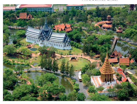
The Ancient City

Opposite the City Hall, this remarkable white pagoda, commonly called "Phra Chedi Klang