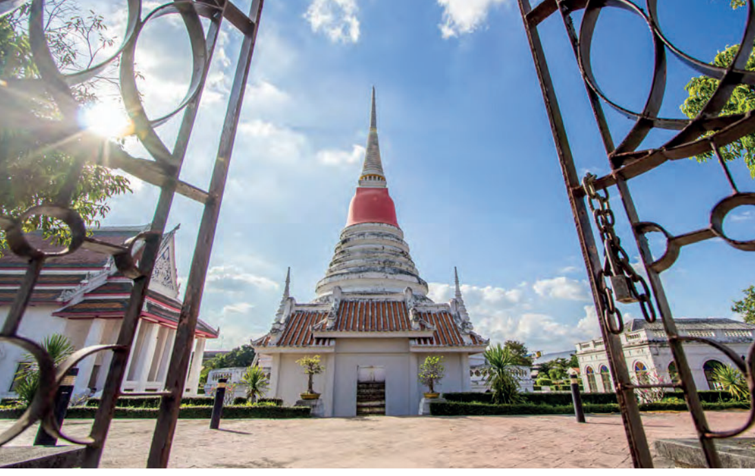
Phra Samut Chedi

Also known as Pak Nam, this province, located at the mouth of the Chao Phraya River only 25 kilometres south of Bangkok, can easily be reached by bus or taxi. Visitors, for example, can take a No. 511 air-conditioned bus (Pinklao-Pak Nam) which passes along Ratchadamnoen Avenue and Phetchaburi Road during the earlier stage of the journey.