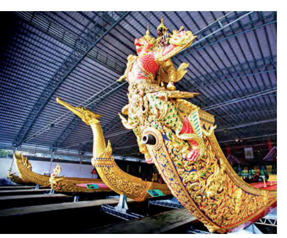
Royal Baraes National Museum