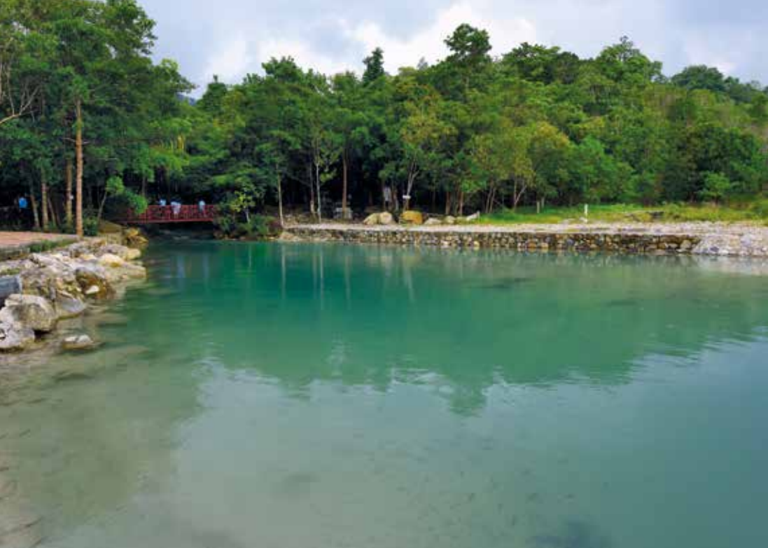
Phon Rang Hot Spring

ground level is suitable for recreation because there are a restaurants, souvenir shops and car park area provided for tourists.