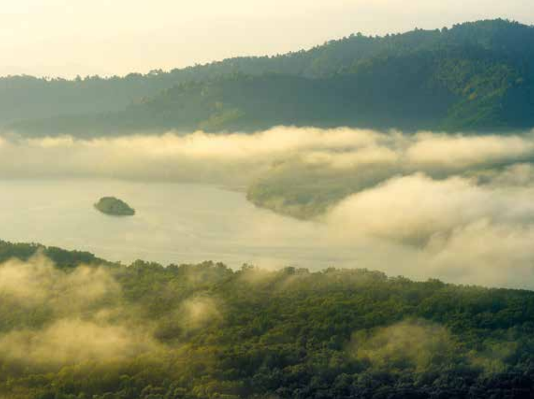
Kra Buri River or Pak Chan River

is located at 130 Mu 3 Ban Hin Chang, Tambon Paknam, covering an area of 2,061,278 rai in Amphoe Mueang Ranong, Amphoe Kra Buri and Amphoe La-un of Ranong province. Encompassing a moist evergreen forest area with biodiversity of flora and fauna, it was proclaimed a national park on 21 April 1999.