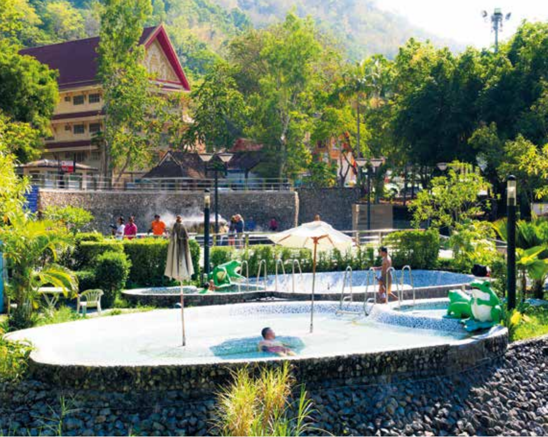
Raksawarin Hot Springs and Public Park