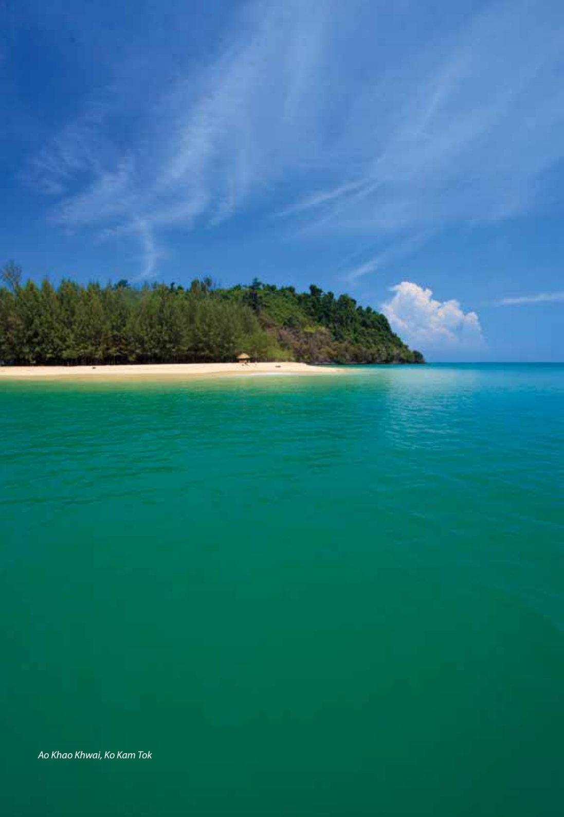
Ao Khao Khwai, Ko Kam Tok