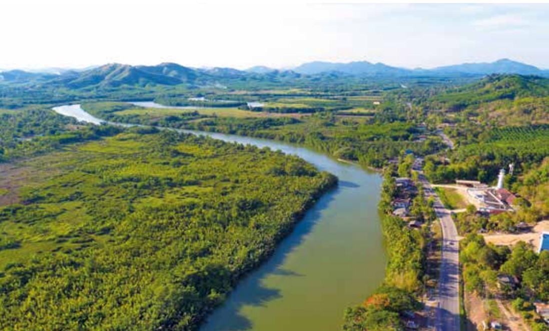
Kho Khot Kra or Kra Isthmus

formerly known as Khao Yang, is located at Ban Lamliang. An old legend of "Phra Khayang" Cave links to the establishment of Kra Buri town. Deep inside the entrance for around 40 metres, there is a staircase leading upward to the top of