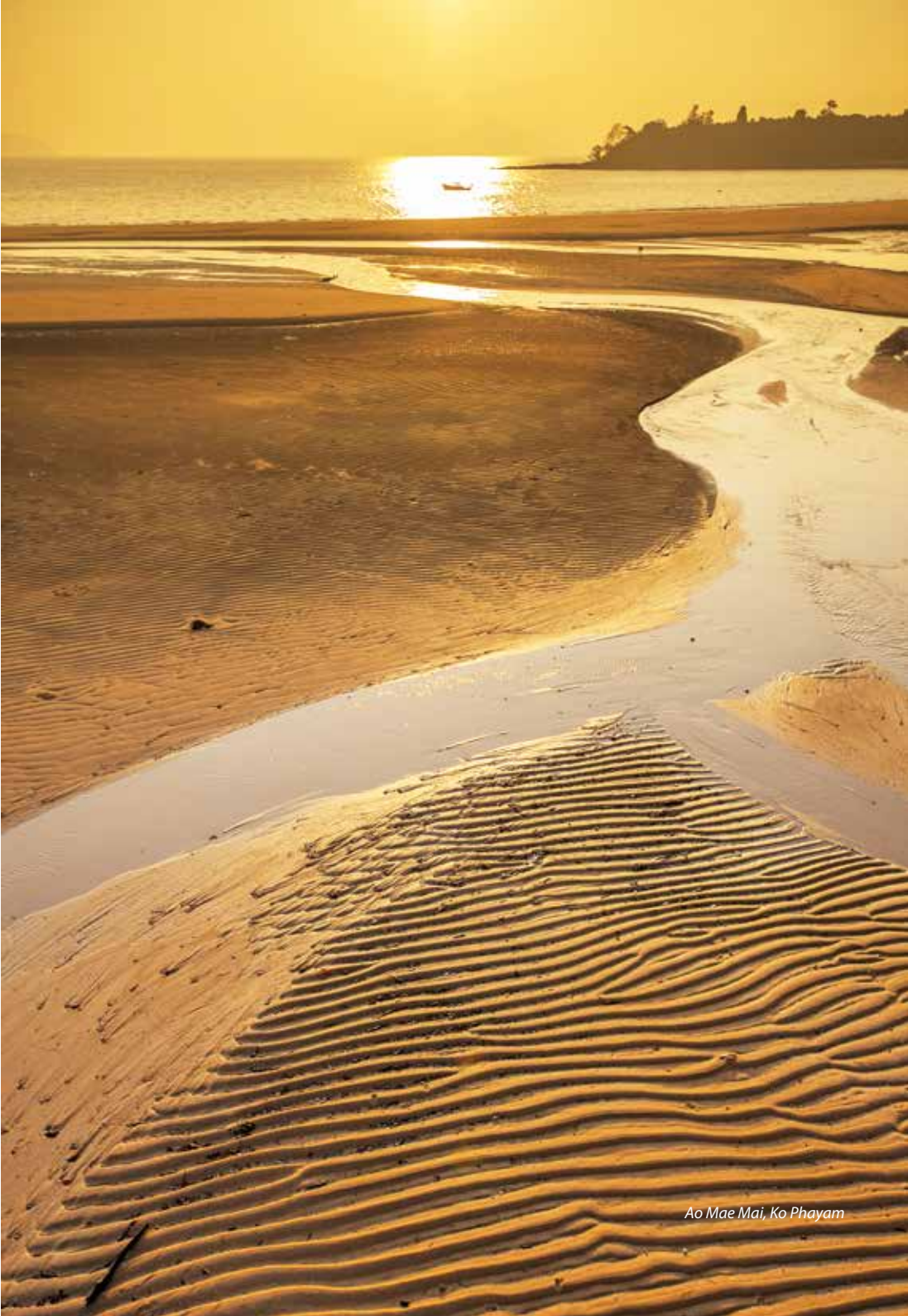
Ao Mae Mai, Ko Phayam