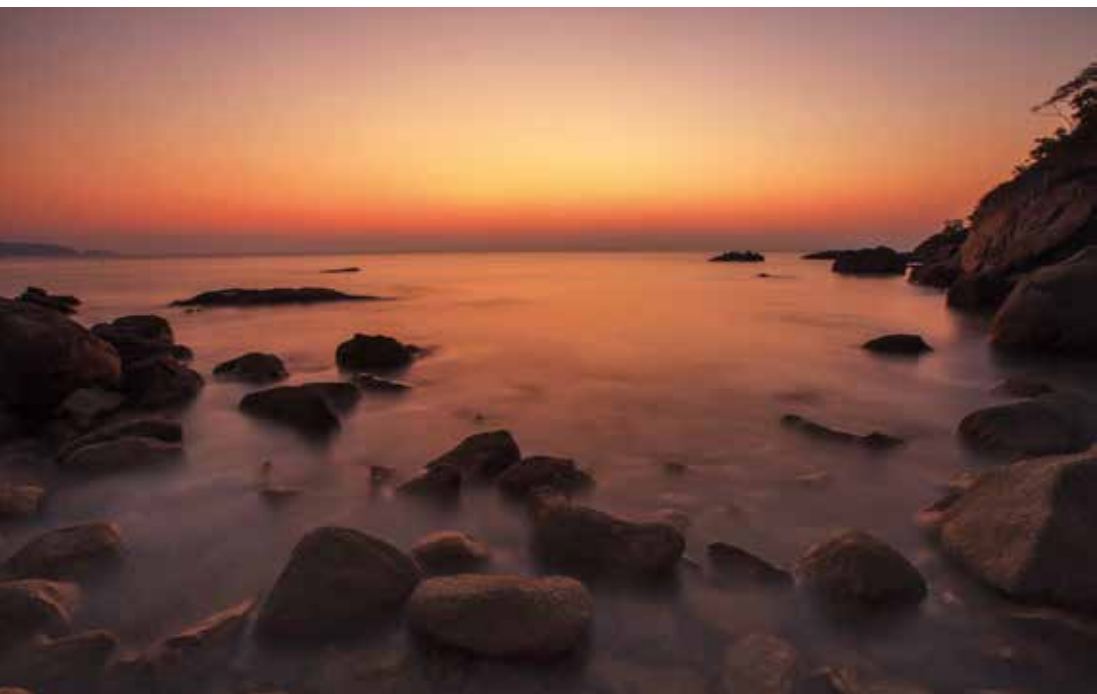
Ao Ta Daeng, Ko Chang

Route 3: Tin Smelter–Talat Phama (Burmese Market)–Talat Sot Thetsaban–Rattanakosin Road–Fish Dock (Pier to Ko Song or Victoria Point)