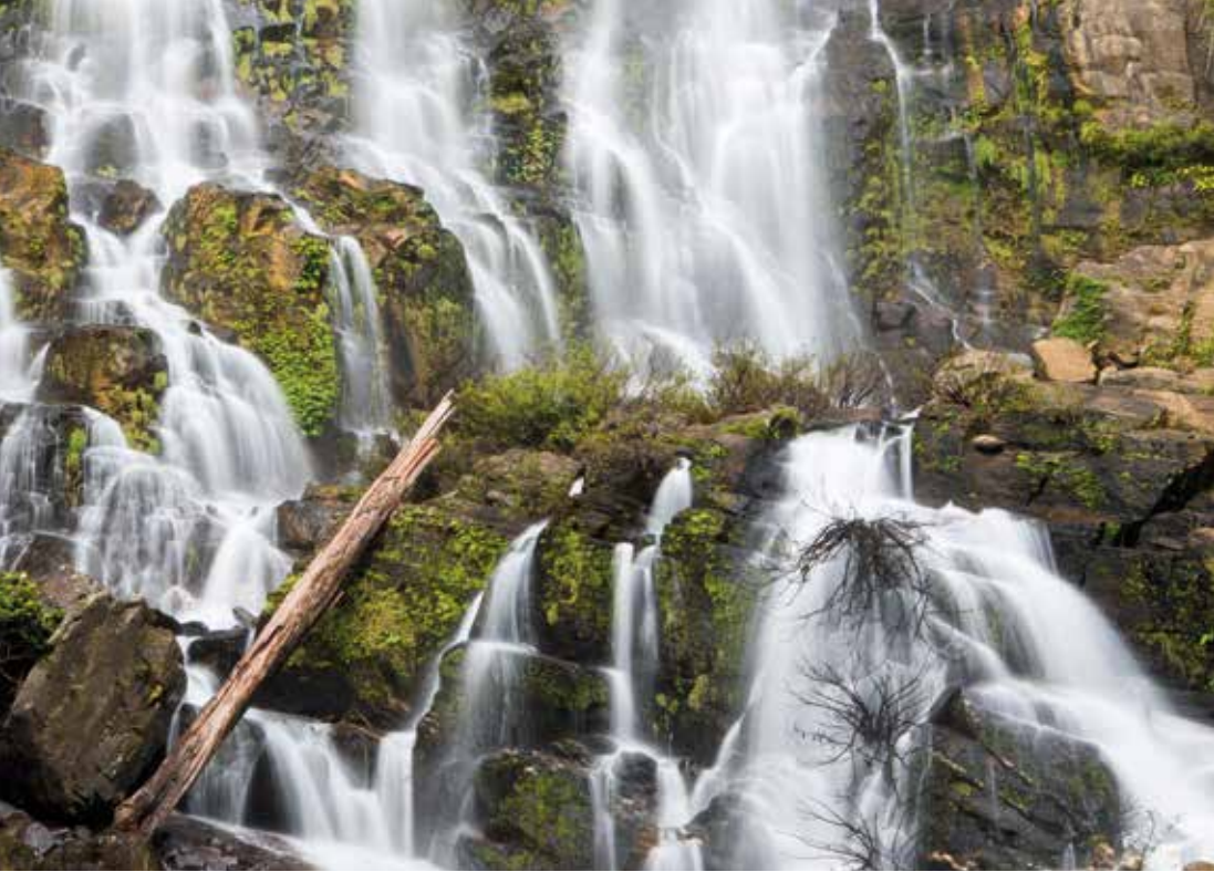
Namtok La-ong Dao