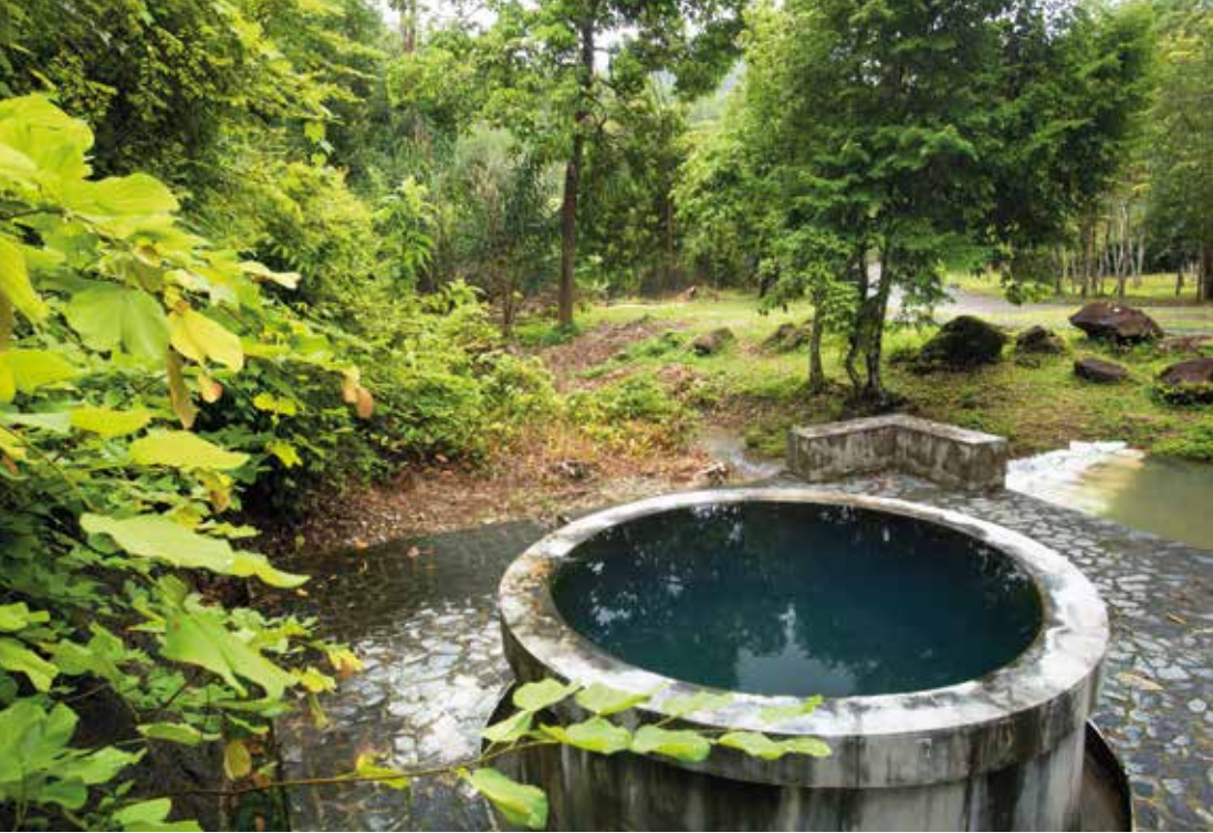
Hat Yai Hot Spring

Subdistrict Administration Organisation Tel. 0 7781 0759, 0 7781 0453.