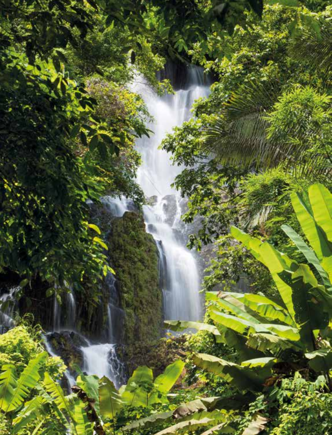
Namtok Chum Saeng or Namtok Sai Rung (Chum Saeng Waterfall or Sai Rung Waterfall)