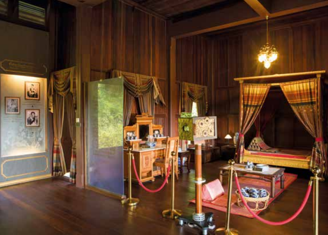
Rattana Rangsan Throne Hall