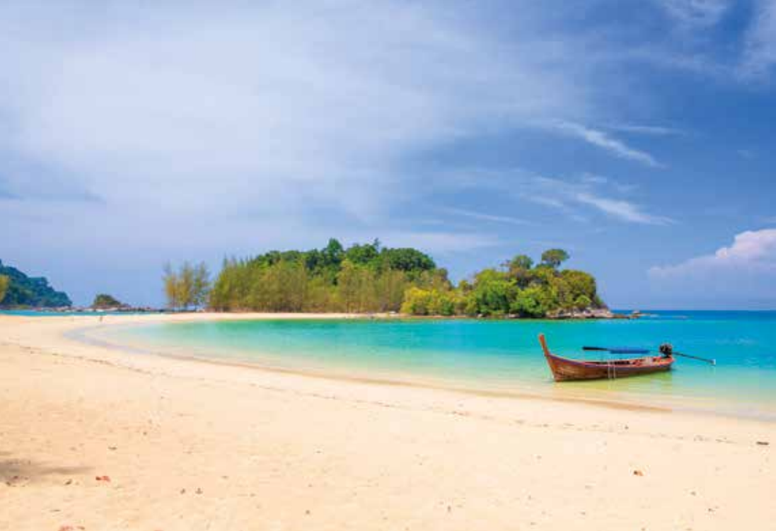
Ao Khao Khwai, Ko Kam Tok

There are interests in this National Park; such as, Hat Bang Ben (หาดบางเบน) A long and vast sandy beach, shaded by pine trees along the beach, it is where the National Park headquarters is located. Visitors will enjoy the scenic view of islands from here.