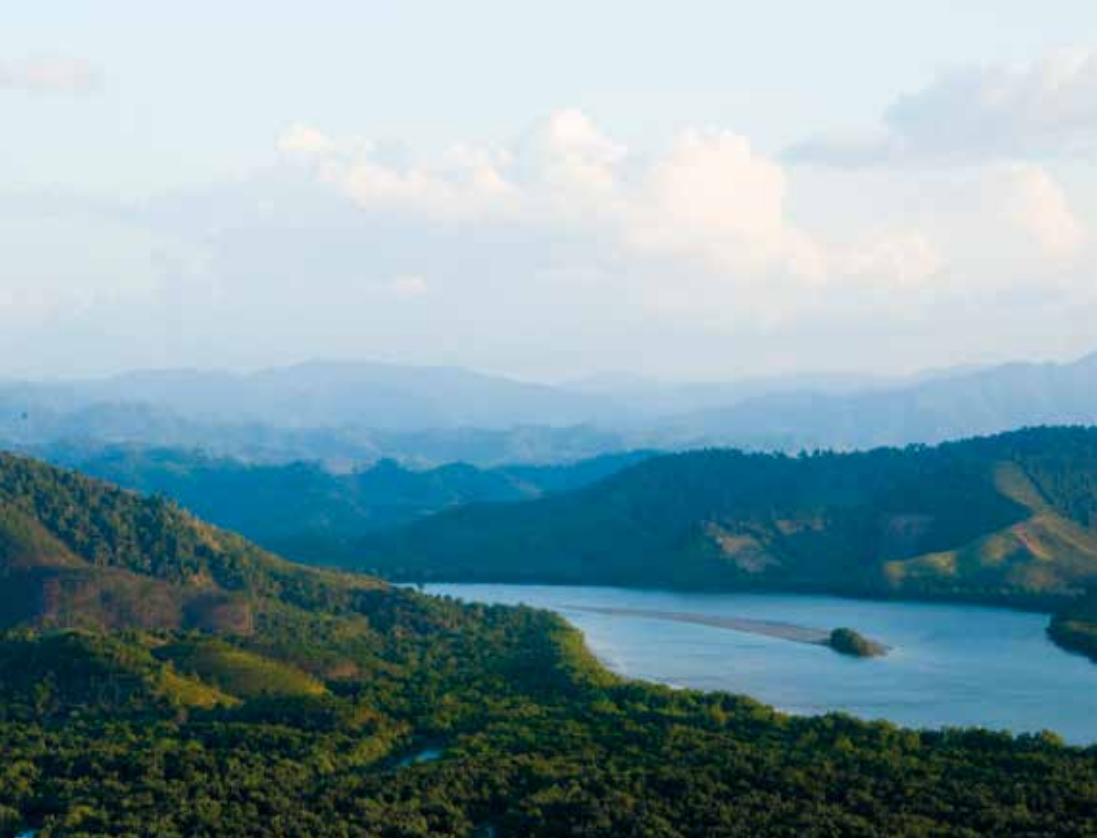
Khao Fa Chi

homestay accommodation in the natural garden surroundings is also provided Tel. 0 3512 3456, 08 7268 1285 www.gongvalley.com To get there: From Ranong, take highway no. 4 at Km.556-557; turn to the same direction as Namtok Bok Krai about 2 km.