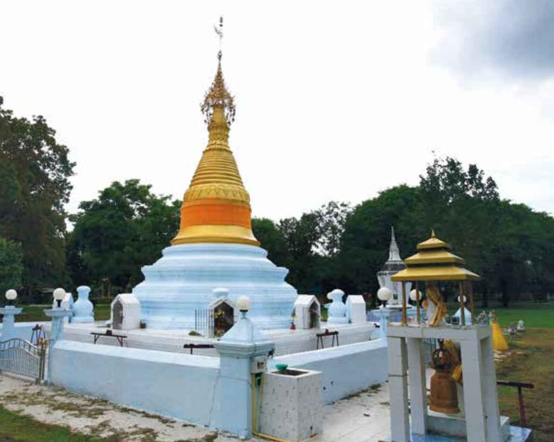
Wat Suwan Khiri or Wat Na Mueang