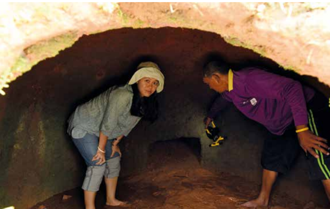
Japanese Troops' Tunnel

Tham Nam Lot (ถ้ำน้ำลอด) is a 2-floored complicated cave located at Mu 3, Tambon Nai Wong Tai. The upper floor features scenic stalagmites and stalactites, and visitors can walk through to the other side of the cave where there is a cliff overlooking beautiful nature. The ground floor has a stream running through. For more information, please contact La-un Nuea