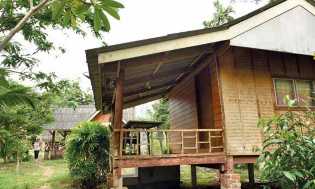
Ban Muang Kluang Muslim Homestay