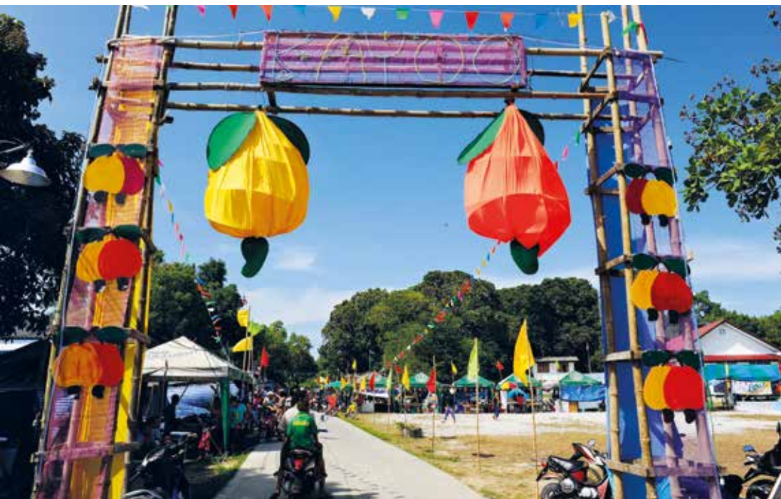
Cashew Nut Festival

Cashew Nut Festival (งานกาหญ) takes place on Ko Phayam in February, which is the harvest season of ripened Kayu or cashew nuts, and features exhibitions and contests of agricultural produce; such as, cashew nut