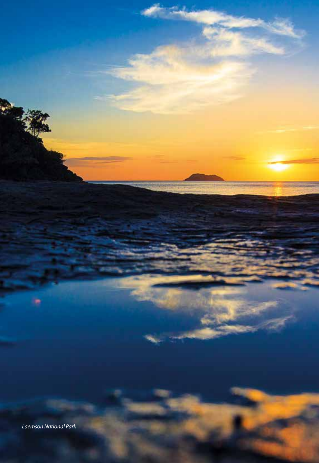
Laemson National Park