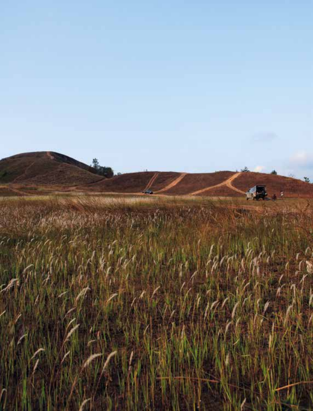
Phukhao Ya (Grass Hill) or Khao Hua Lan (Bald Hill)