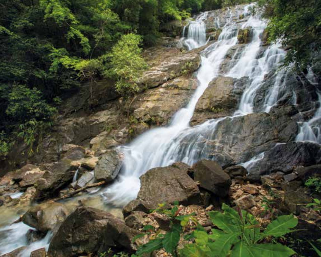
Namtok Ngao National Park