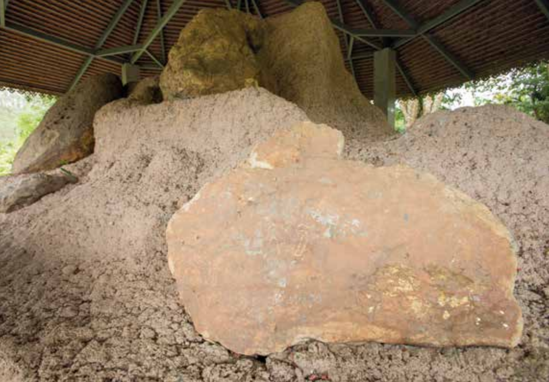
Royal Initials Rocks

this island there are several resorts offering accommodation for visitors. The best period for travelling during November-May.