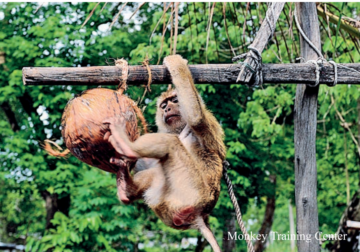
Monkey Training Center