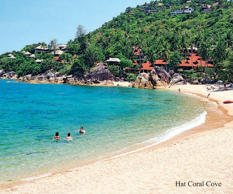
Hat Coral Cove