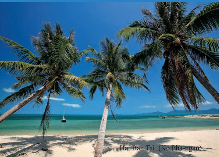
Hat Ban Tai (Ko Pha-ngan)