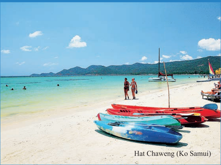
Hat Chaweng (Ko Samui)